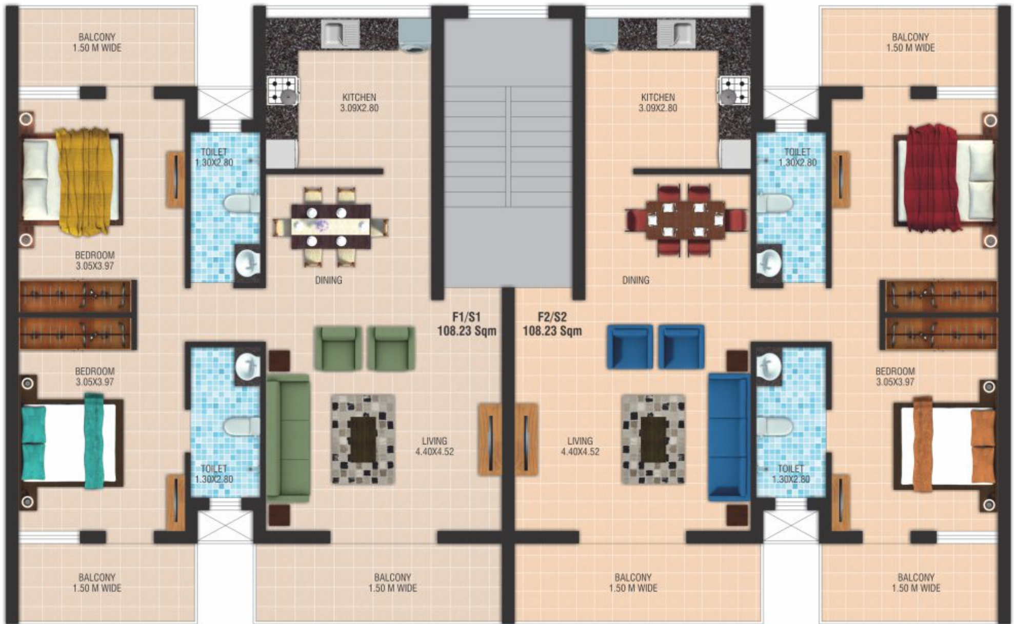
BLOCK C - FIRST & SECOND FLOOR PLAN