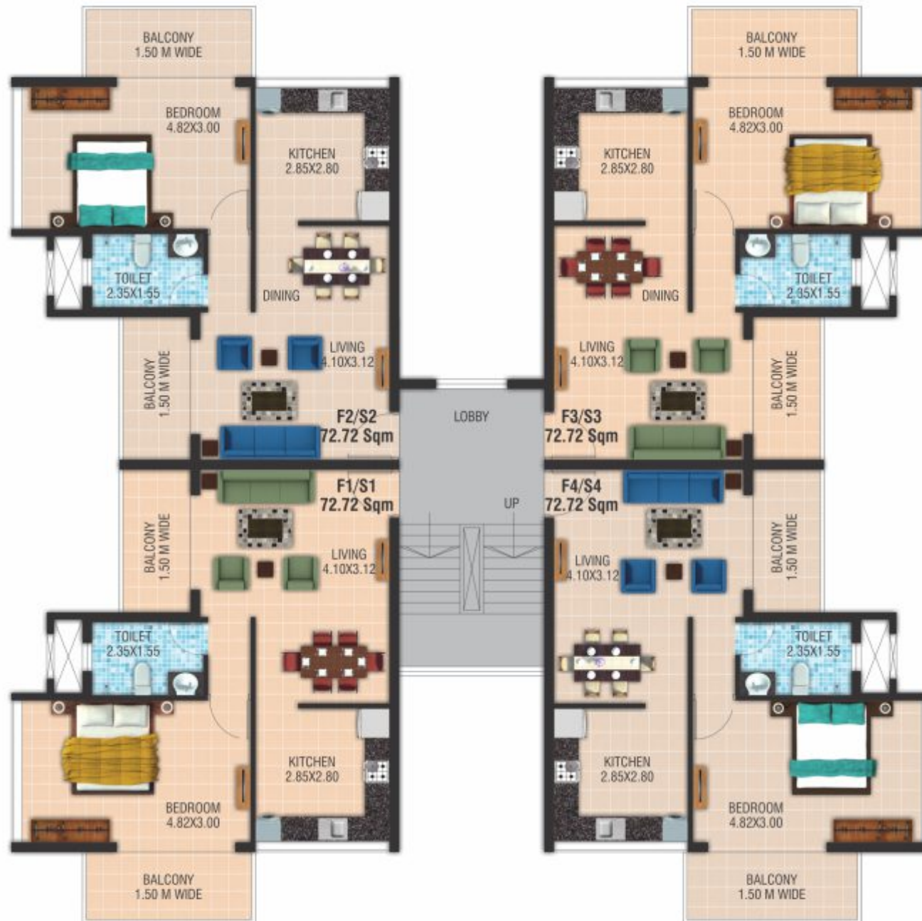
BLOCK B - FIRST & SECOND FLOOR PLAN