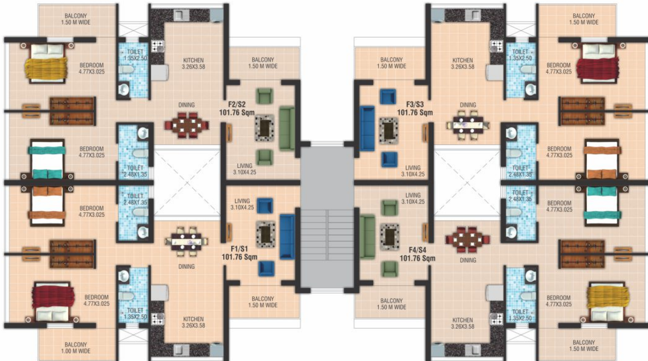
BLOCK A1 & A2 - FIRST & SECOND FLOOR PLAN