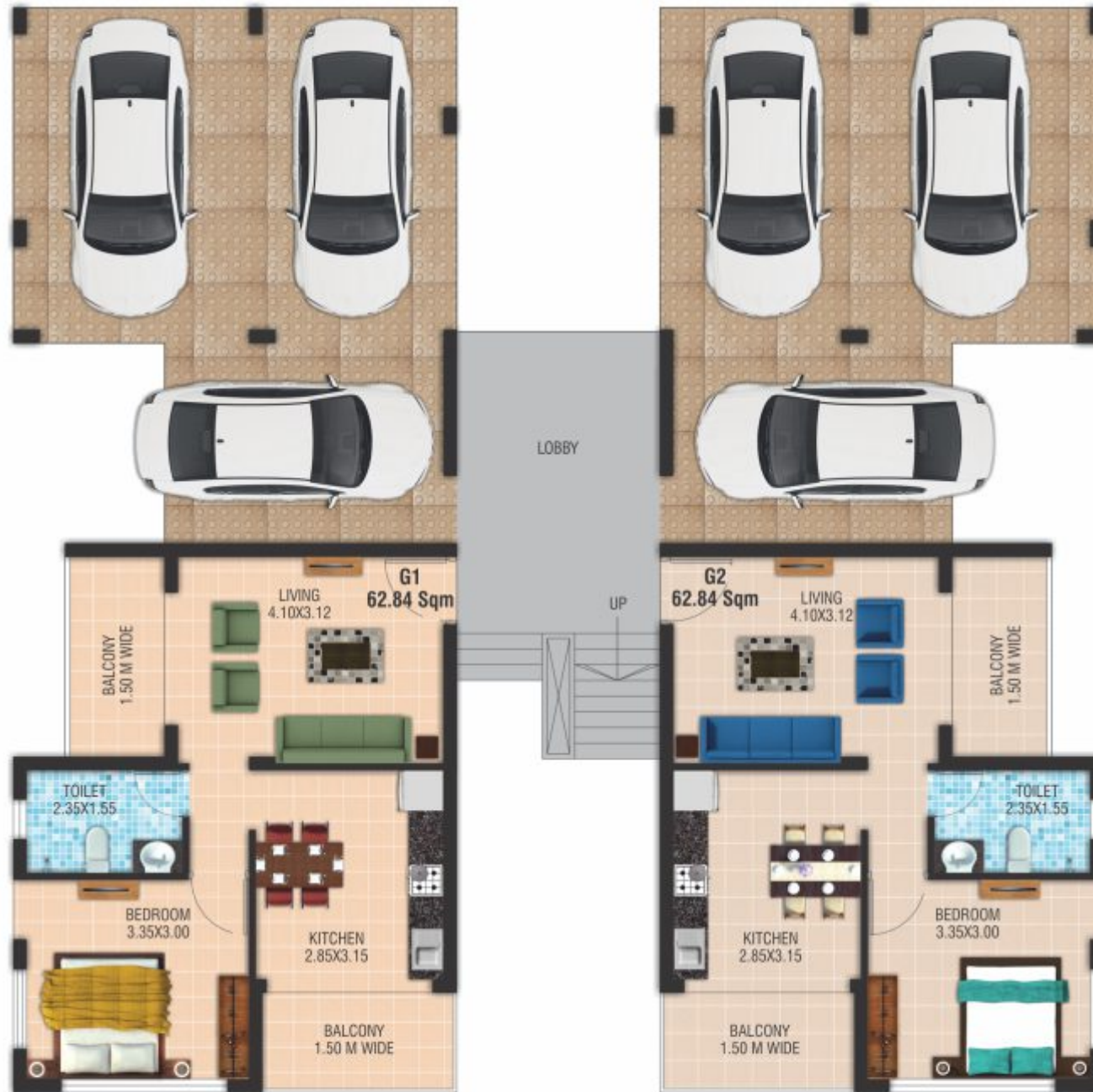
BLOCK B - GROUND FLOOR PLAN