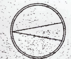
GROUND FLOOR PLAN SCALE 1:100