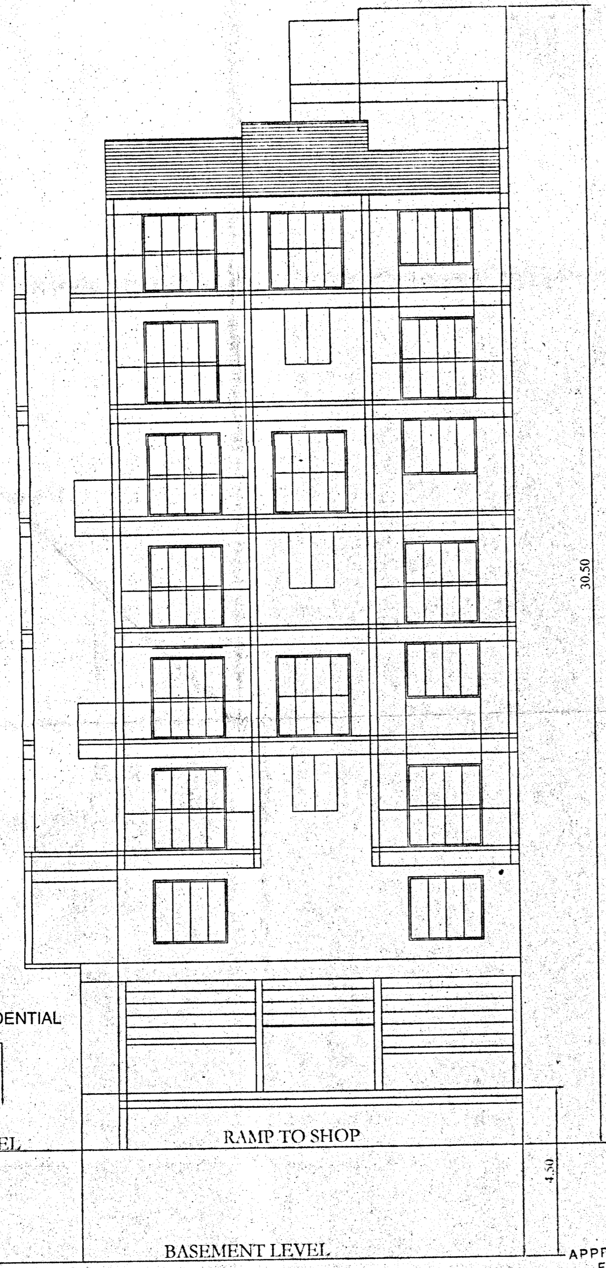
MAIN ROAD ELEVATION SCALE 1:100