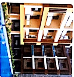
CD Jade Blue