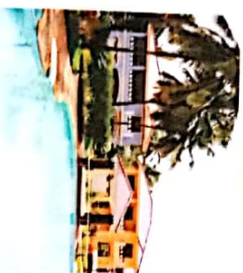
CD Monsoon Meadows

been a two decade old relationship with quality. And we treasure it.