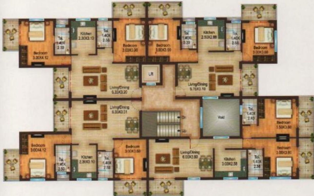
TYPICAL FLOOR PLAN (FIRST & SECOND FLOORS)