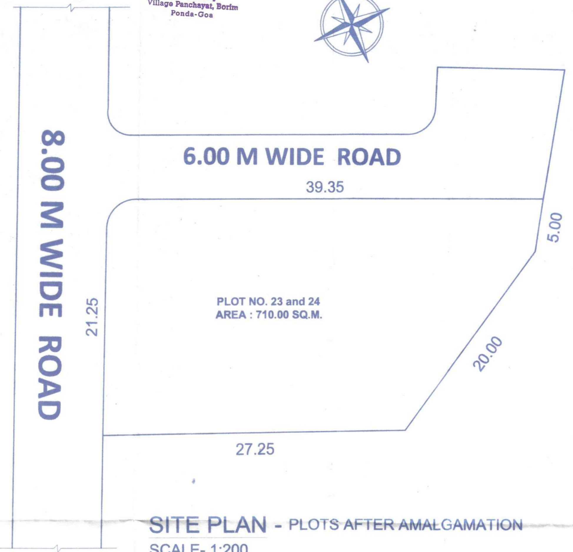
SITE PLAN - PLOTS AFTER AMALGAMATION SCALE- 1:200