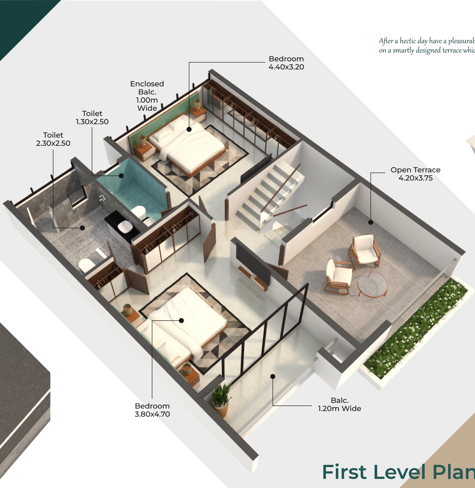
First Level Plan

Ground Level Area Carpet: 53.85 sqm | Built-up : 77.16 sqm