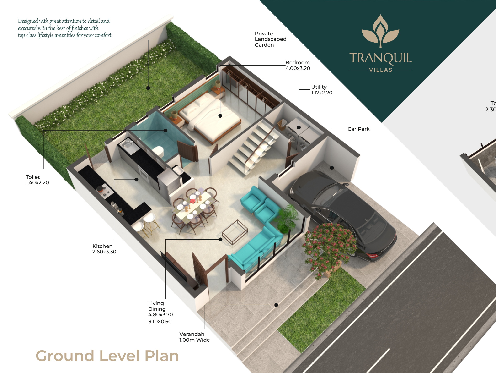
Ground Level Plan