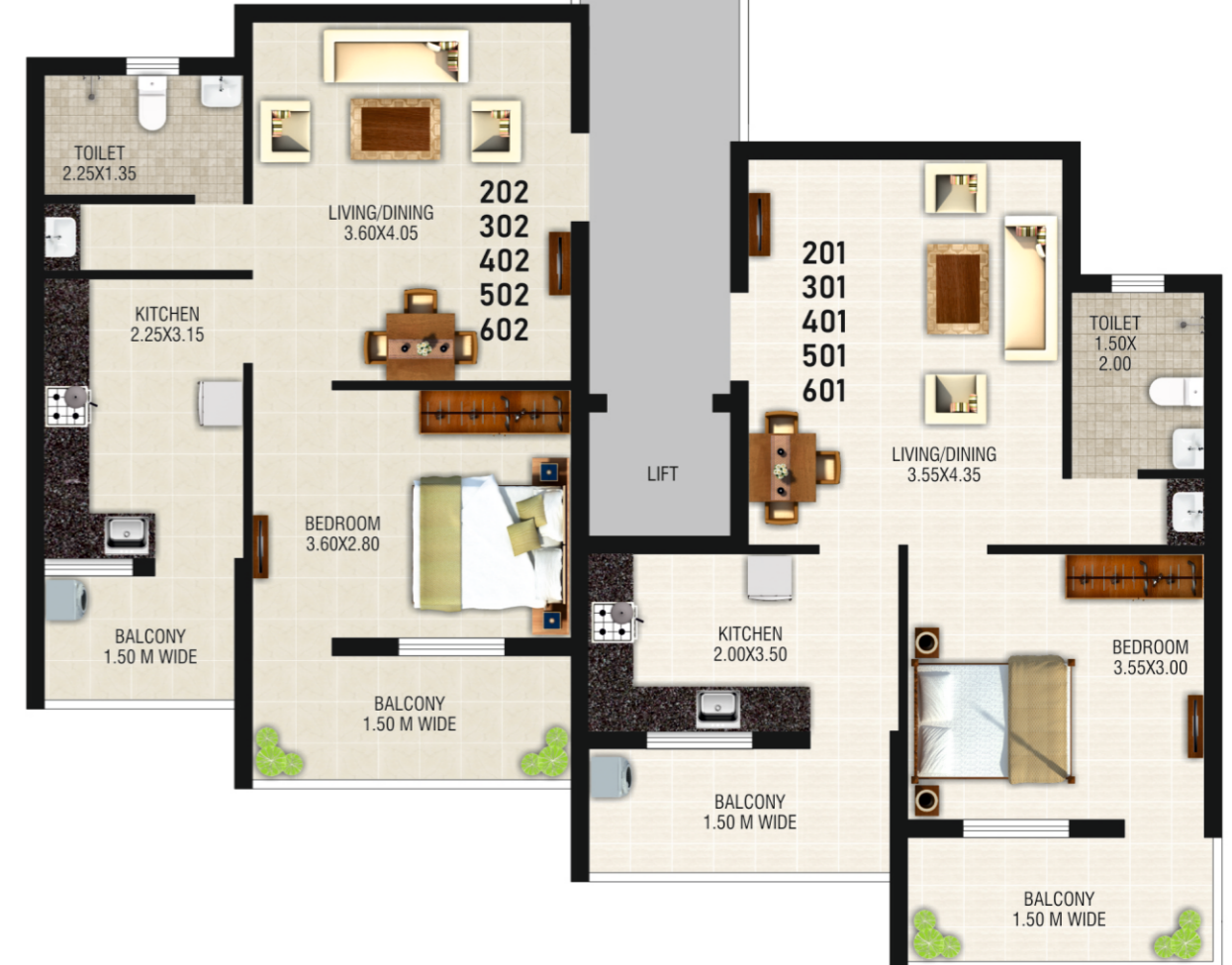
UPPER GROUND FLOOR PLAN