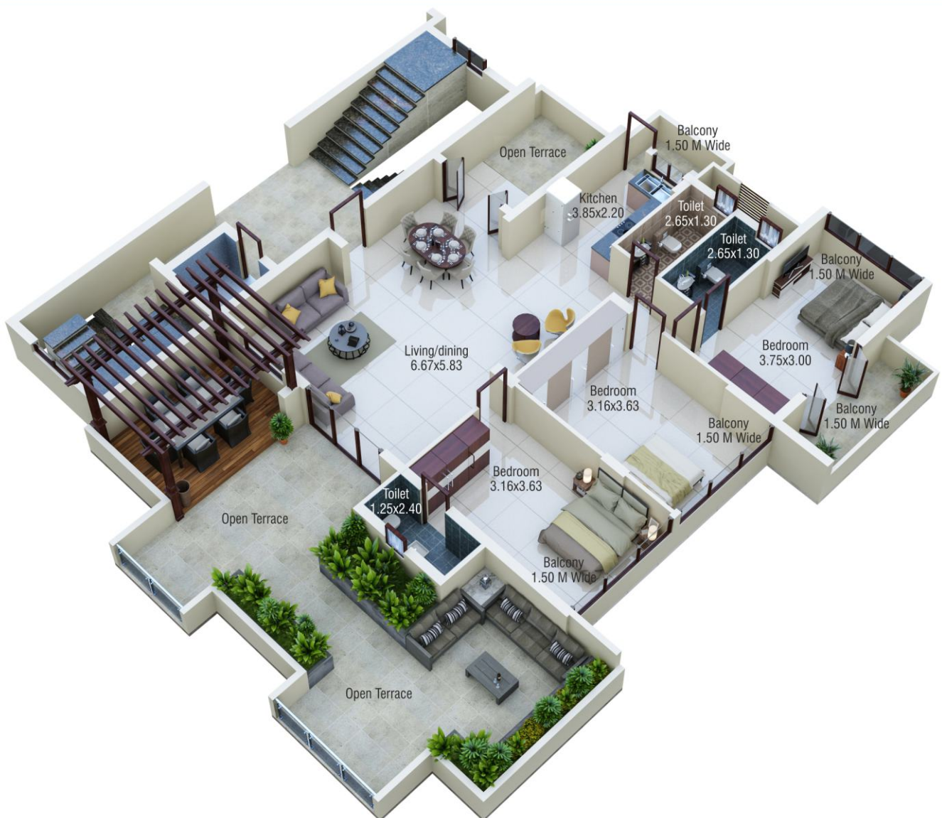
Premium Penthouse Layout

Electrical: 3 phase concealed good quality wiring with Switches of Anchor or equivalent. With electrical point provision for AC, water purifiers, washing machine, power inverter in each flat.