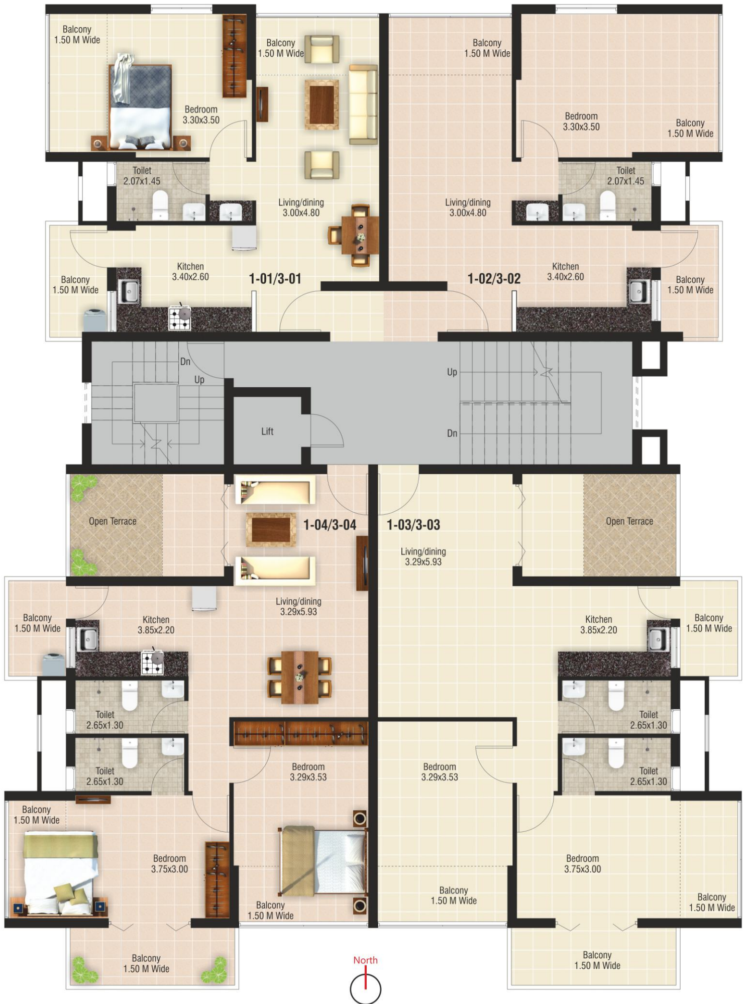
First & Third Floor Plan