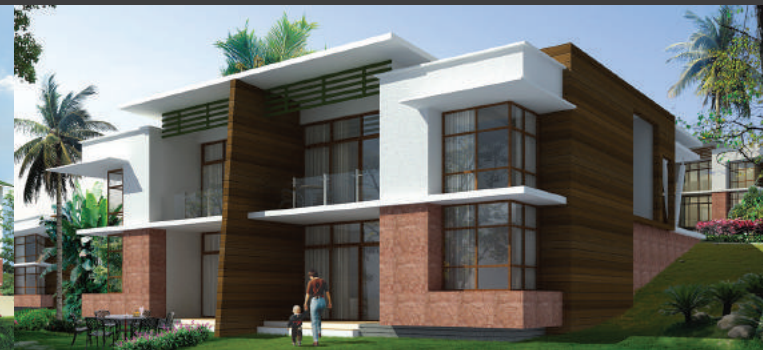
UMIYA Seascapes (Villa Hibiscus)