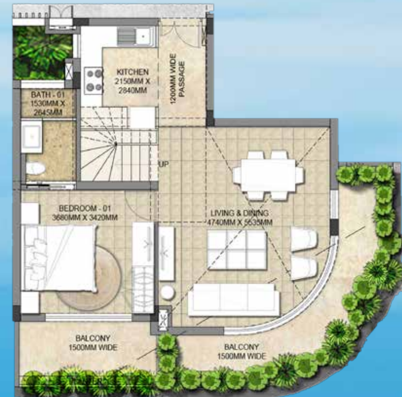
Lower Level Plan

Total Built-up Area: 161.22 sq.m / 1732 sq.ft (includes loading of core area, amenities)