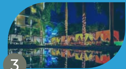
Sinq Night Club