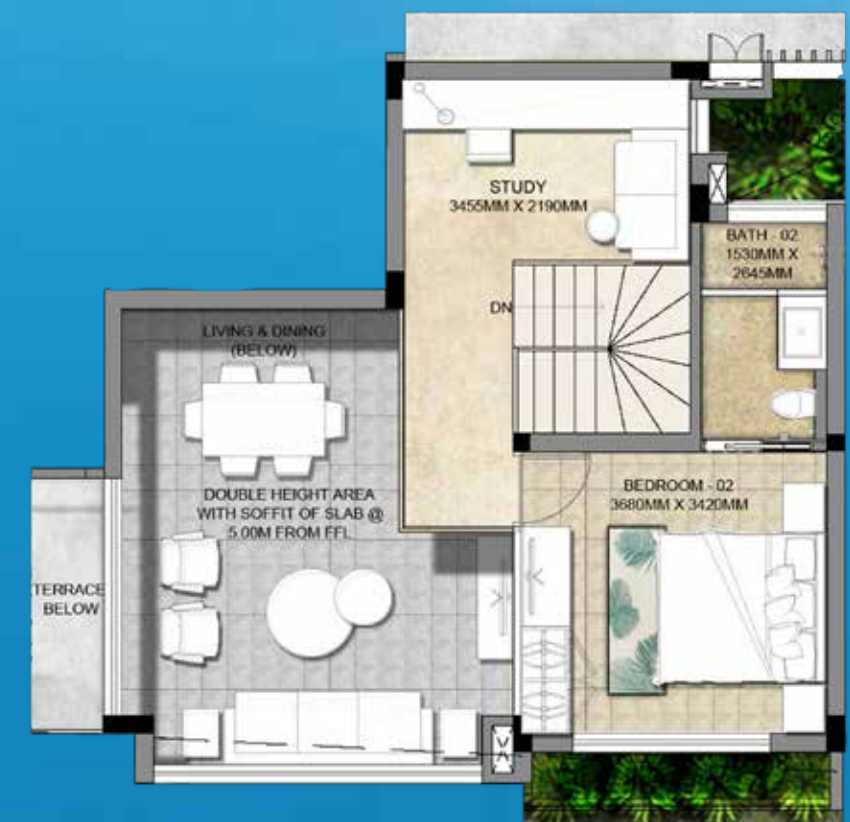
Upper Level Plan