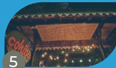
Cohiba Bar & Kitchen