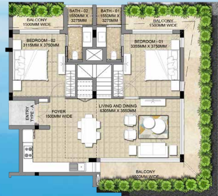
Lower Level Plan