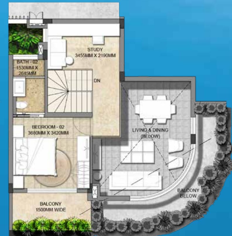
Upper Level Plan