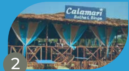
Calamari Bathe and Binge