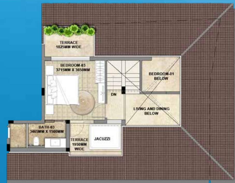
Upper Level Plan