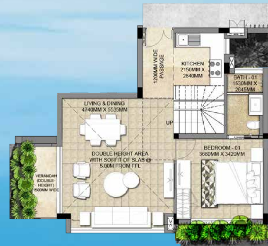
Lower Level Plan

Total Built-up Area: 137.28 sq.m / 1474 sq.ft (includes loading of core area, amenities)