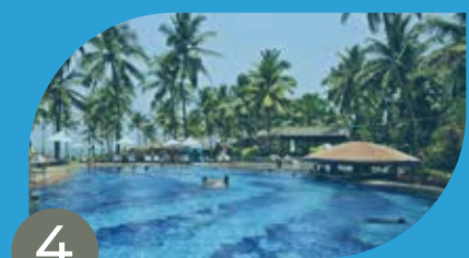
Taj Holiday Village Resort & Spa