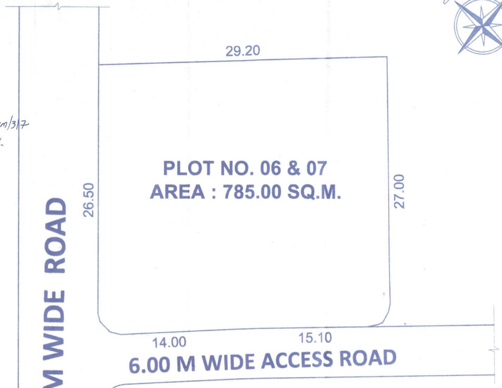
SITE PLAN - PLOTS AFTER AMALGAMATION SCALE- 1:200