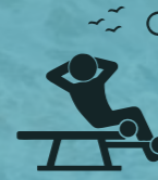
Open Air Gymnasium