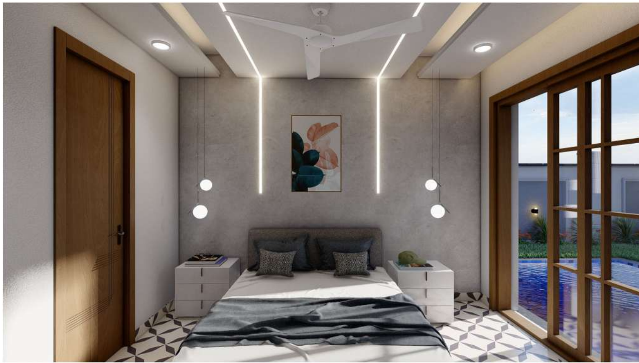
Ground Floor Bedroom