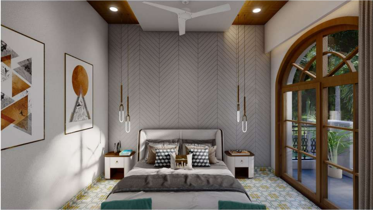
First Floor Rear Bedroom