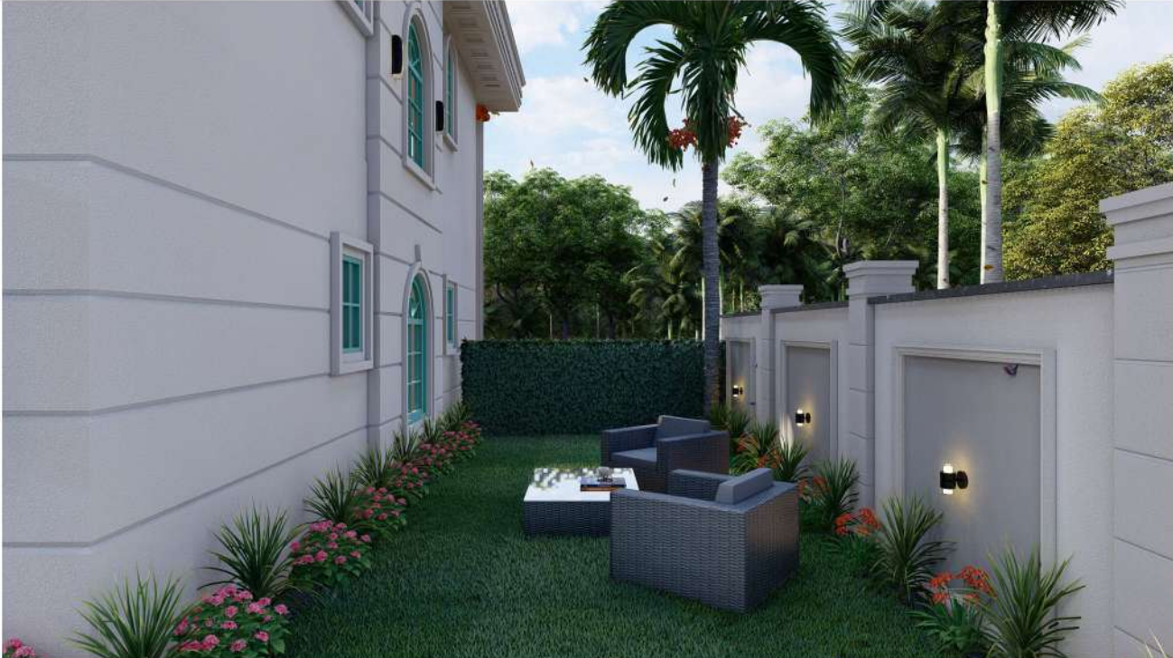
A perfect place to unwind...