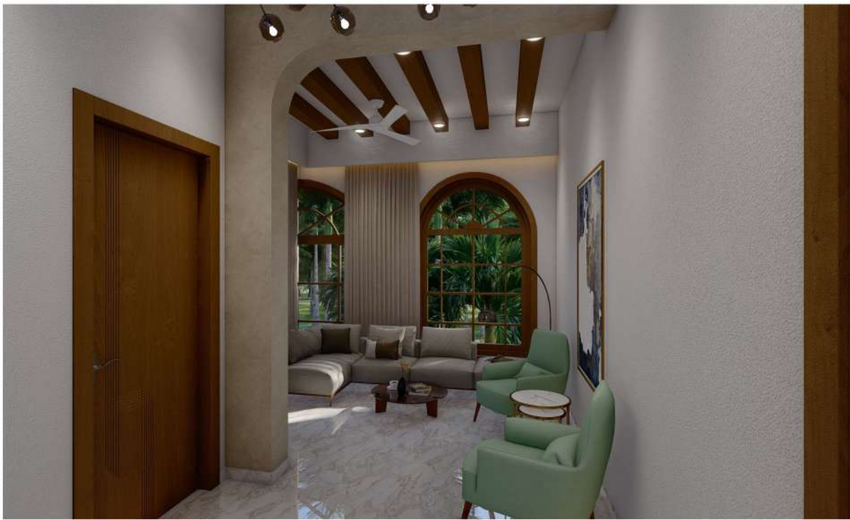
First Floor Lounge