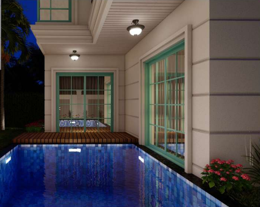
Relax by the fantastic pool...