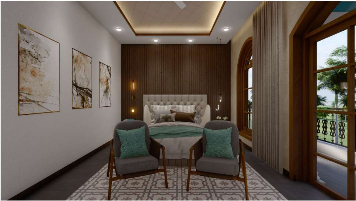
First Floor Front Bedroom