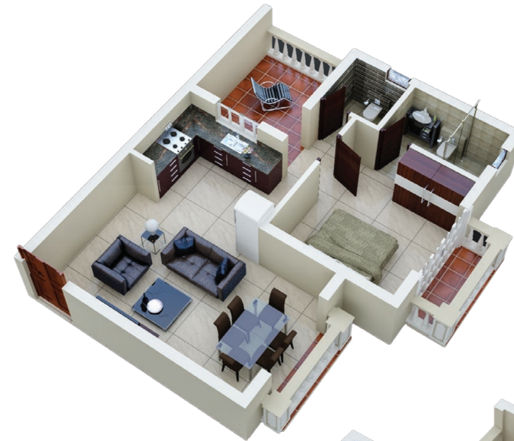
TYPICAL 1 BHK APARTMENT LAYOUTS