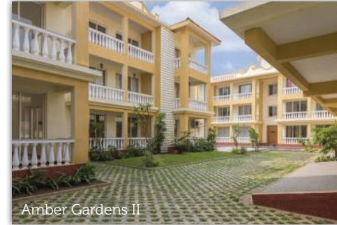
Amber Gardens II