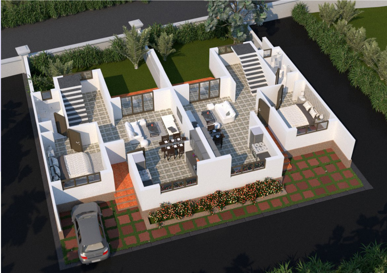
GROUND FLOOR LAYOUT