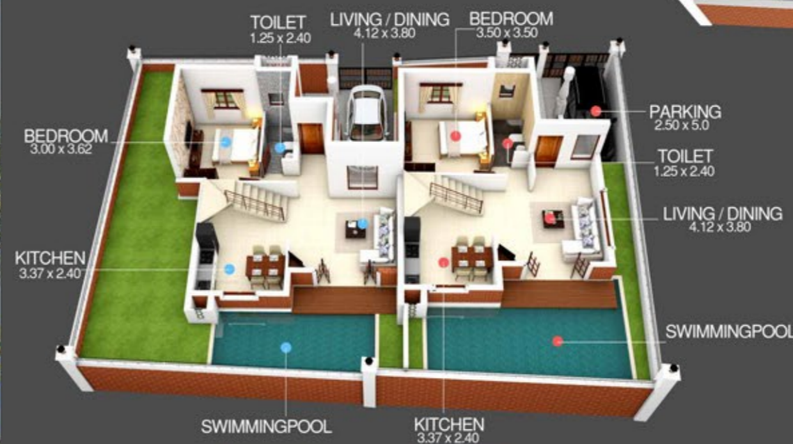
VILLA C VILLA D GROUND FLOOR

These twin villas are conceptualized as Neo classical architecture with 4 BHK configuration. On ground level is a private pool which connects to the living space, dining area and the kitchen. On this floor is a bedroom and powder room. First level has a bedroom with ensuite bathroom and a master bedroom with dresser, bathroom. The second level has the 4th bedroom with ensuite bathroom and an open terrace for a delightful evening.