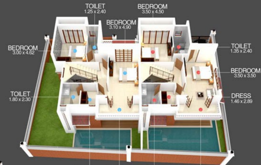
VILLA C VILLA D FIRST FLOOR