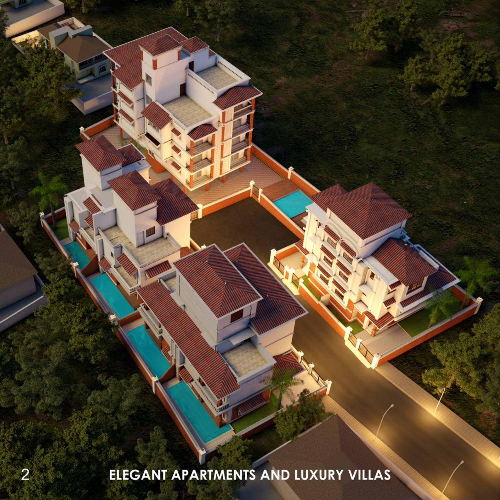
ELEGANT APARTMENTS AND LUXURY VILLAS