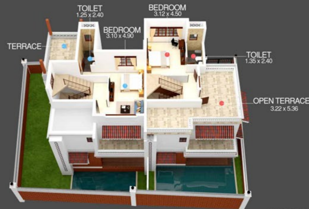
VILLA C VILLA D SECOND FLOOR