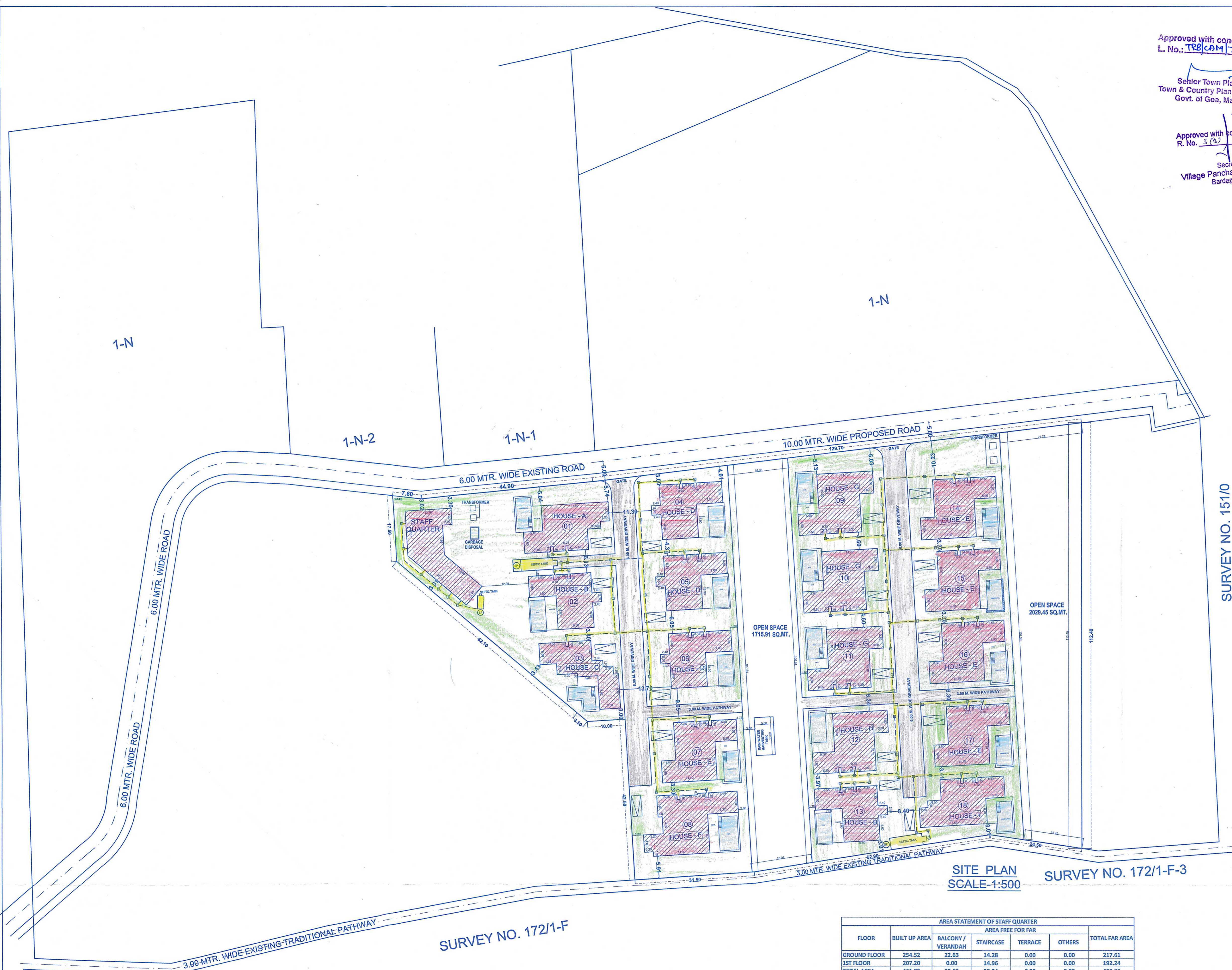
SITE PLAN SCALE-1:500 SURVEY NO. 172/1-F-3