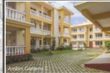
Amber Gardens II