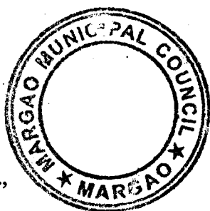
Chief Officer, Margao Municipal Council

To, M/s. Kayji Real Estates Pvt. Ltd., Near Konkan Railway Station, Aquem-Baixo, Margao-Goa.