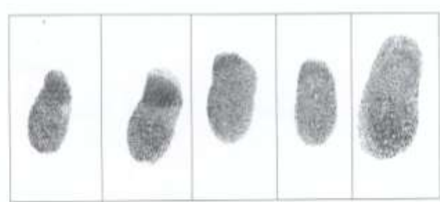
LEFT HAND FINGER PRINTS