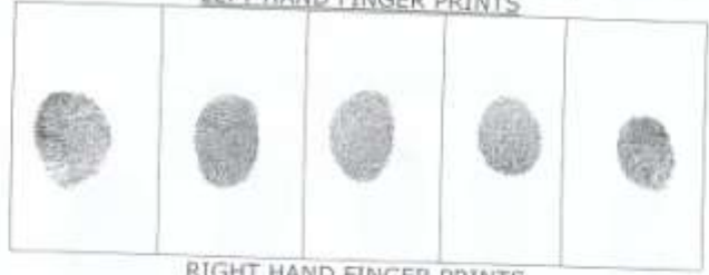
RIGHT HAND FINGER PRINTS