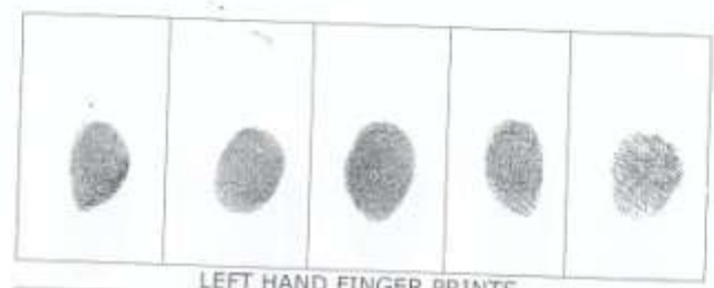
LEFT HAND FINGER PRINTS