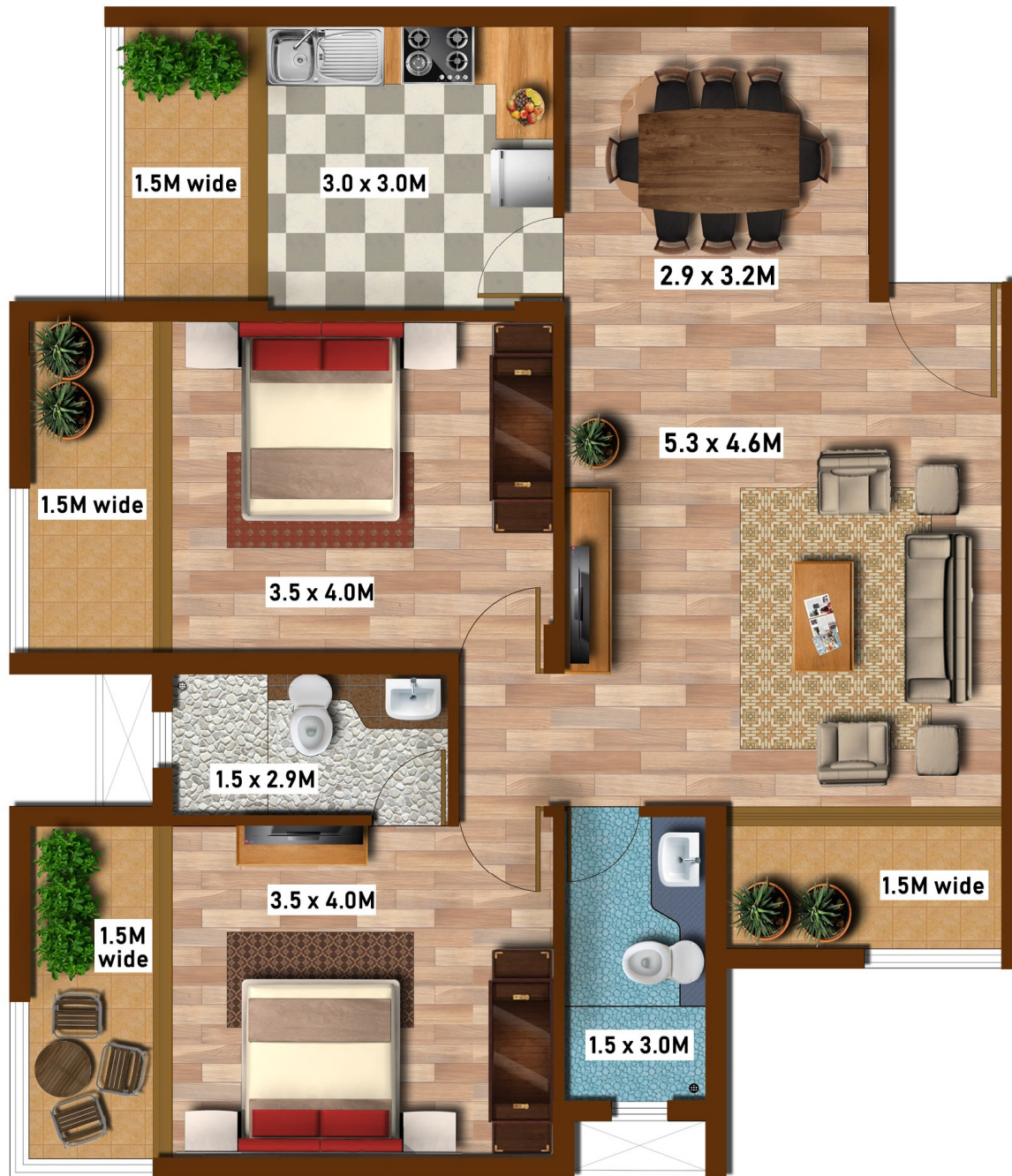
Unit Plan 2 Bedroom Unit (Typical Upper Ground to Fourth Floor)