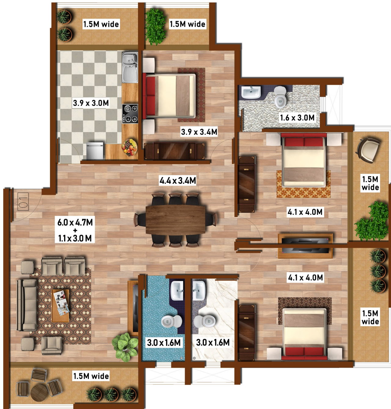
Unit Plan 3 Bedroom Unit (Typical Upper Ground to Fourth Floor)