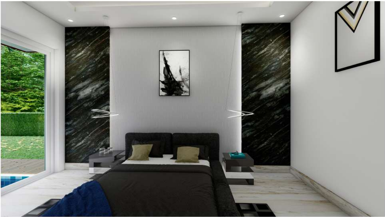
Ground Floor Bedroom