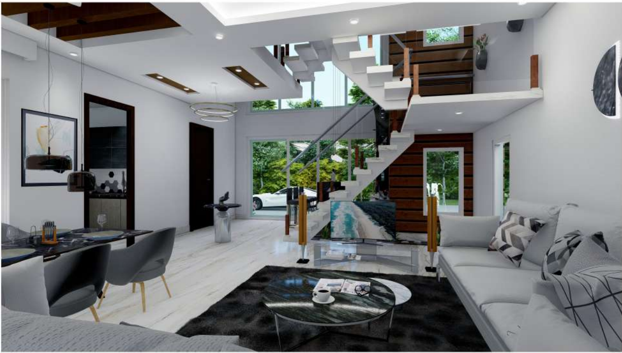
Living/ Dining Room