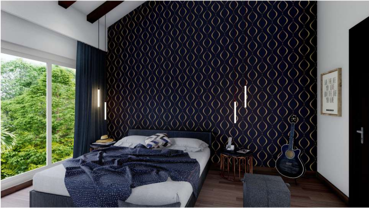
Second Floor Bedroom