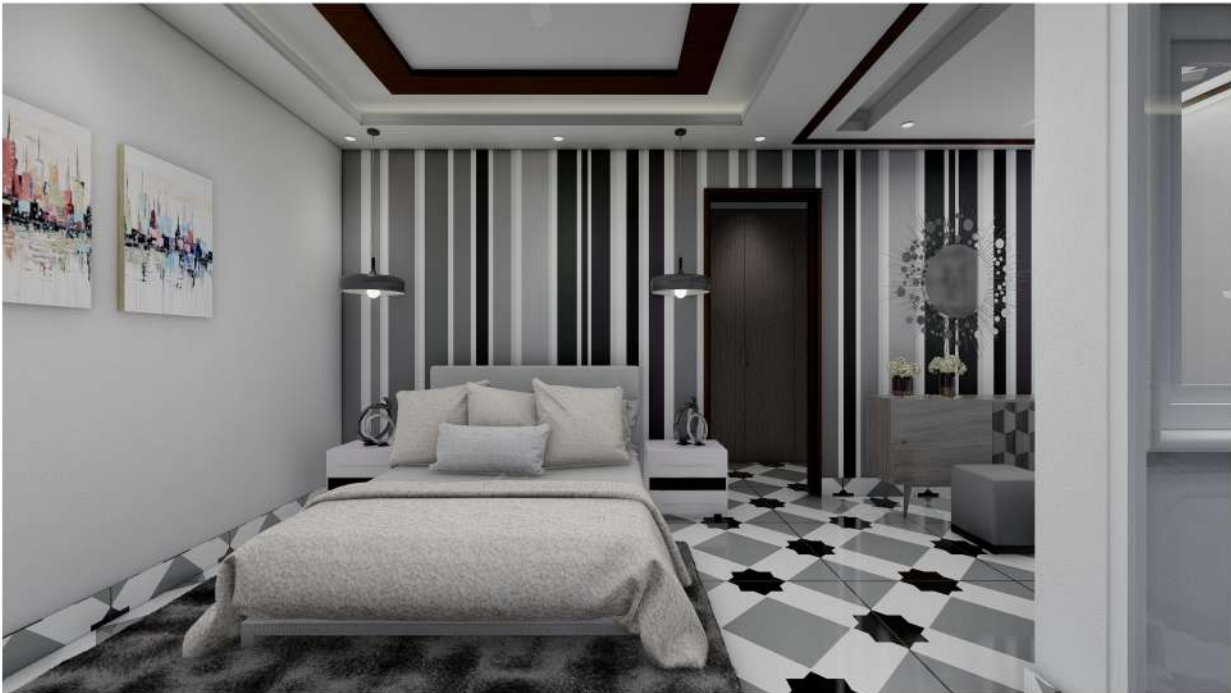
First Floor Bedroom (Right)