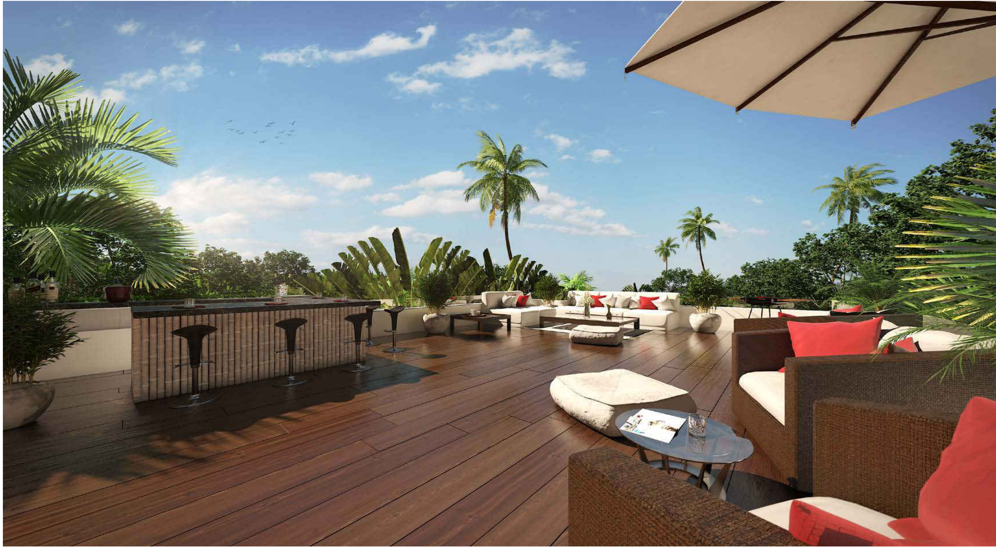
NATURE / SERENE / TRANQUIL