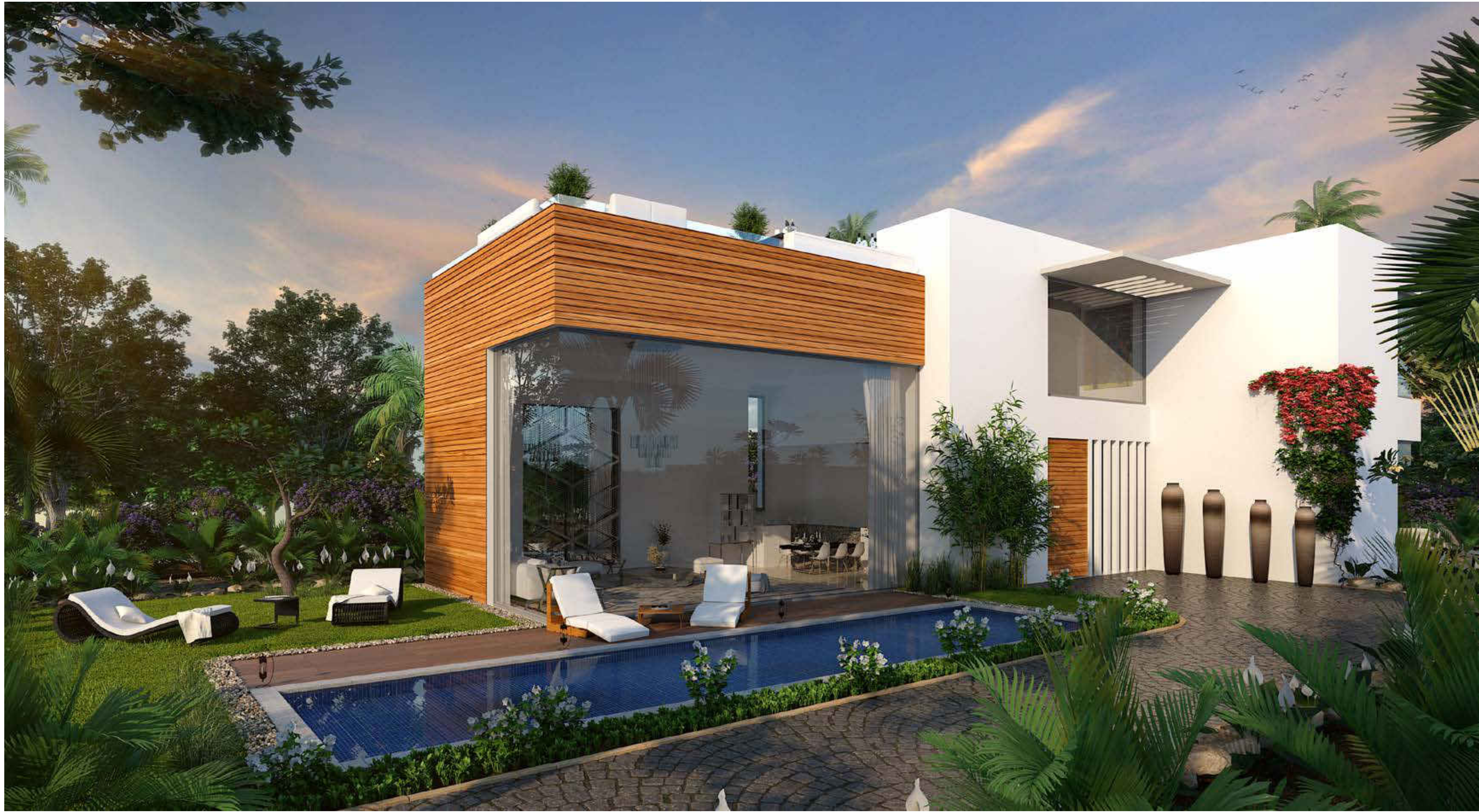
PICTURESQUE SURROUNDINGS / CONTEMPORARY ARCHITECTURE