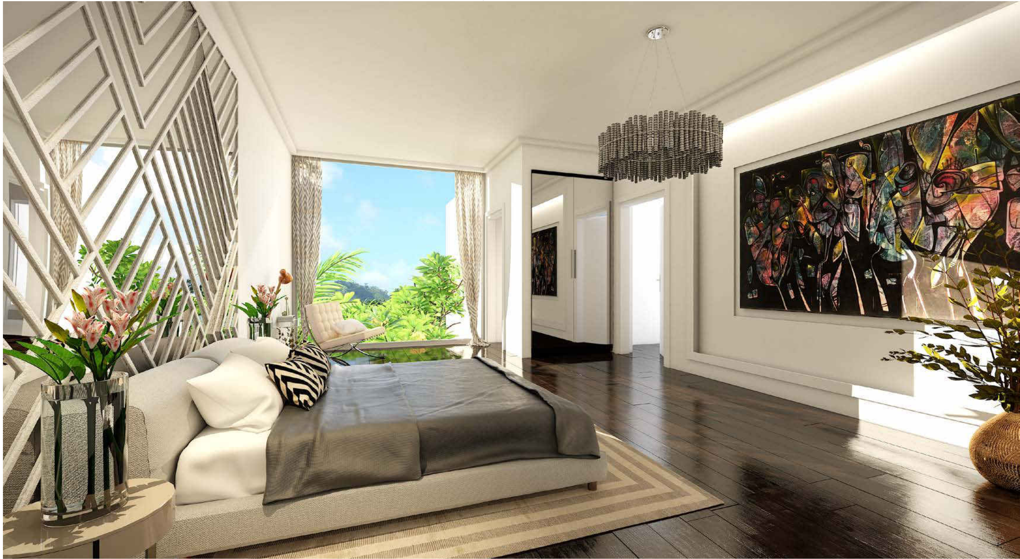
EXPOSED BRICK WORK / VERDANT GREENERY