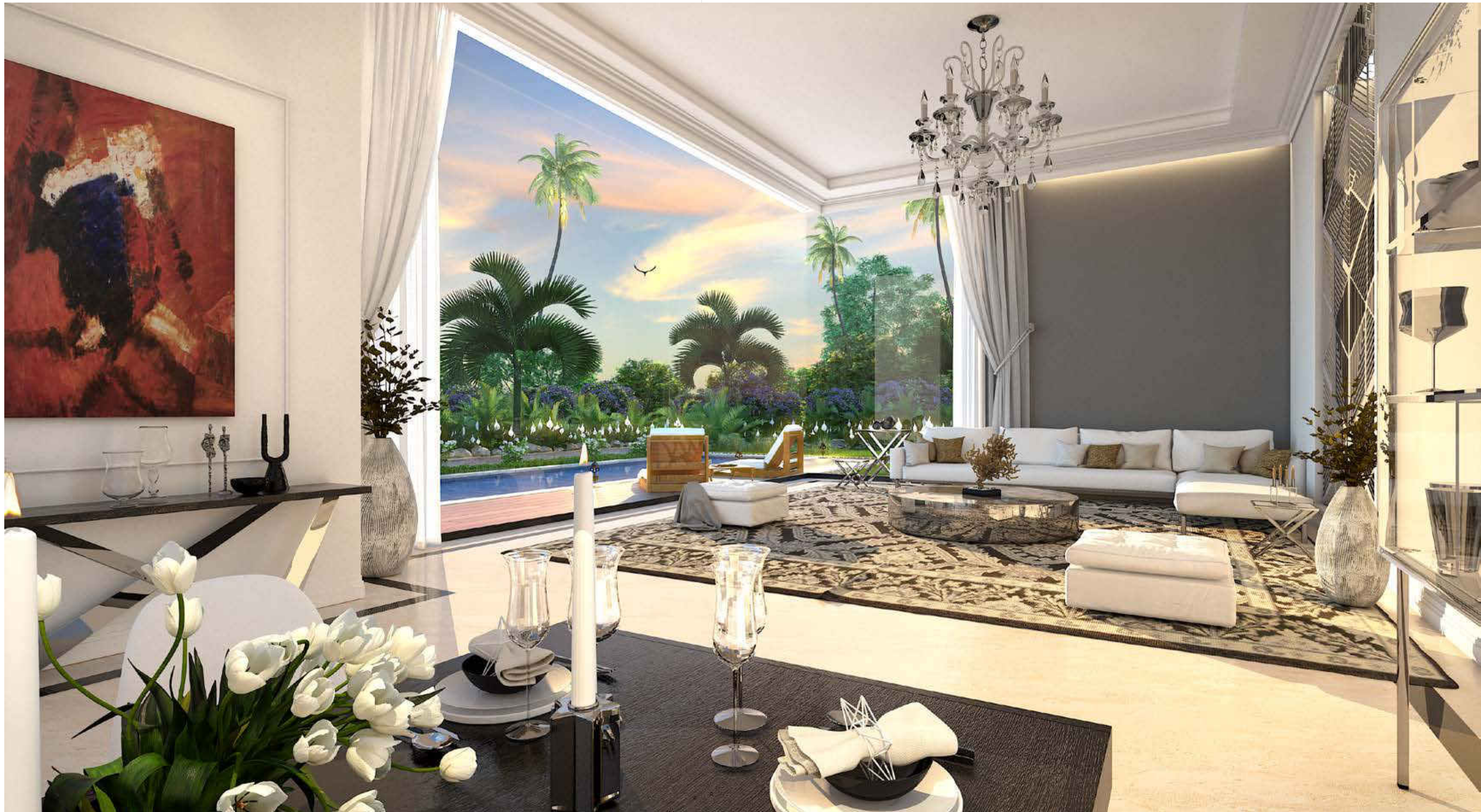
EXQUISITE DÉCOR / VERDANT GREENERY