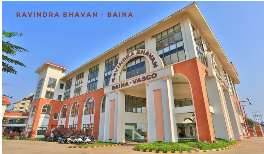
RAVINDRA BHAVAN - BAINA