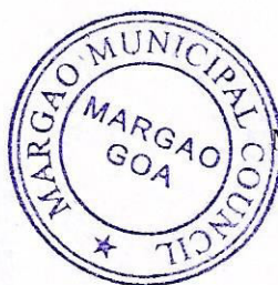
Chief Officer, Margao Municipal Council