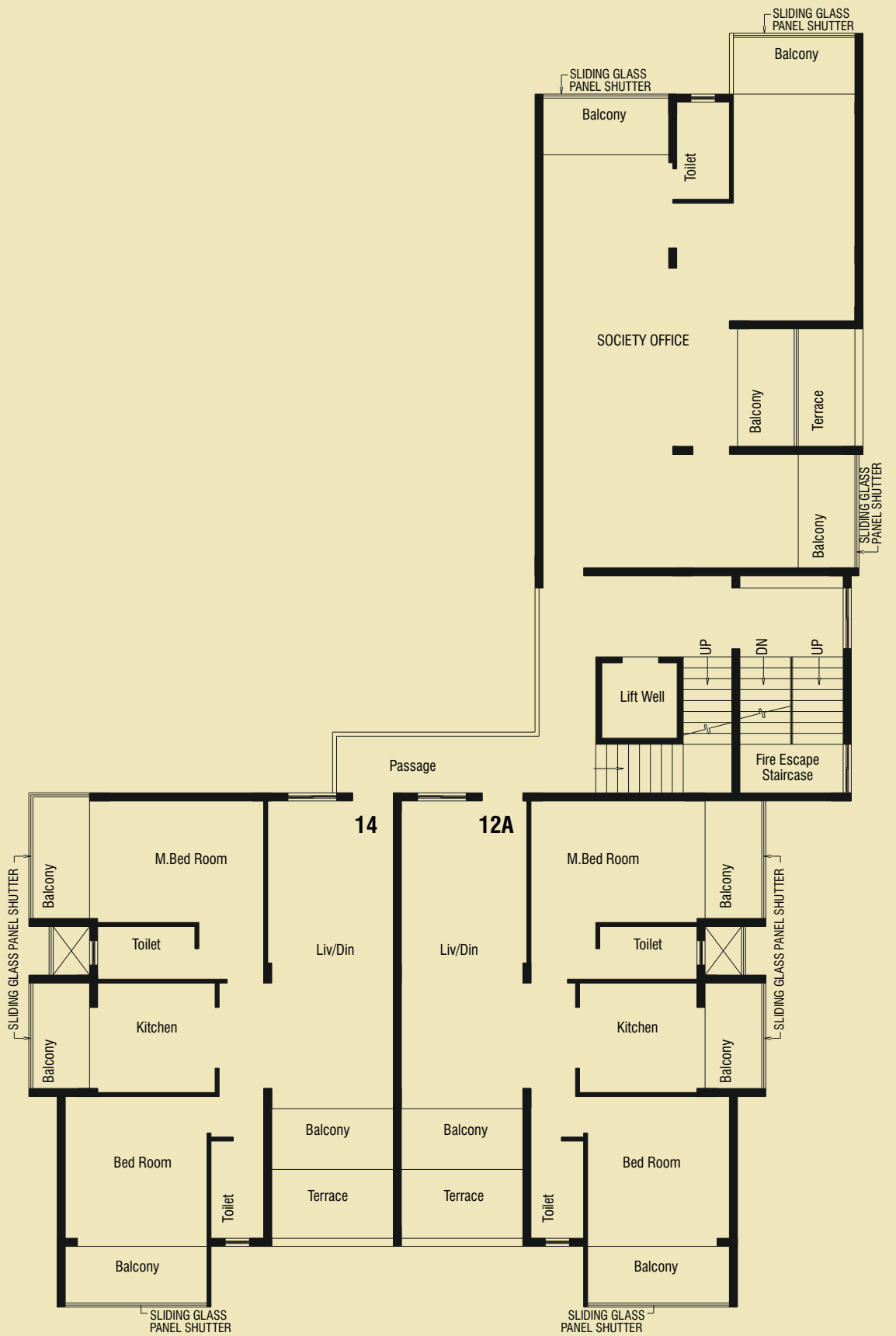
FIFTH LEVEL PLAN