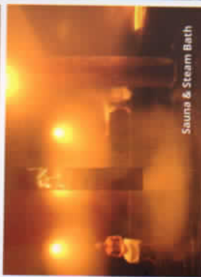
Sauna & Steam Bath