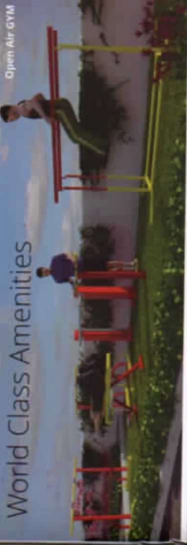
Open Air GYM