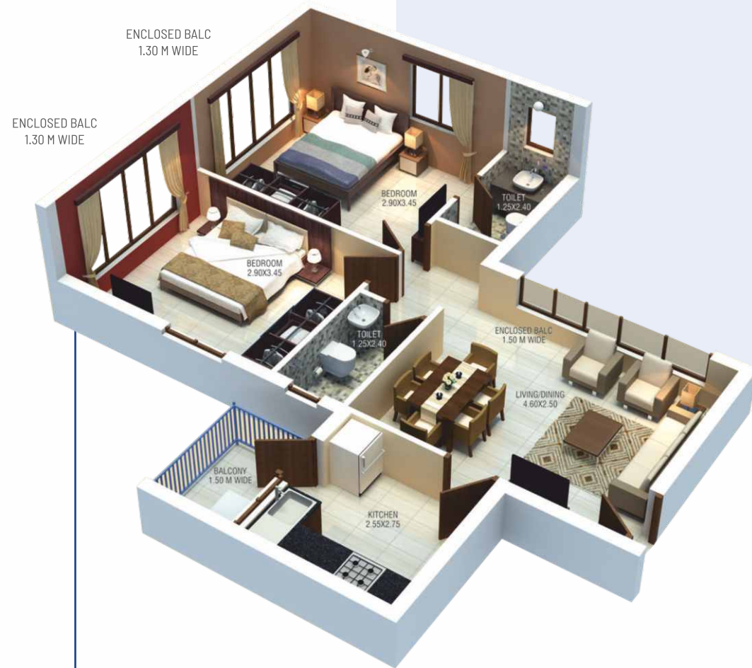
Apartment type 1 - 2 BHK