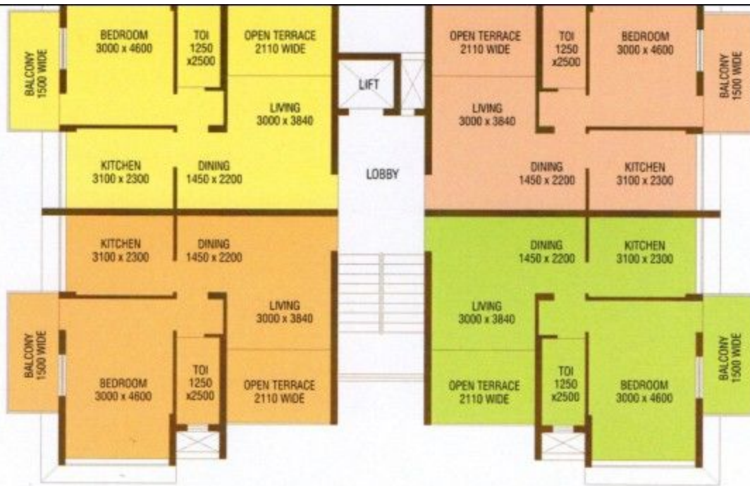
Upper ground & Second floor plan