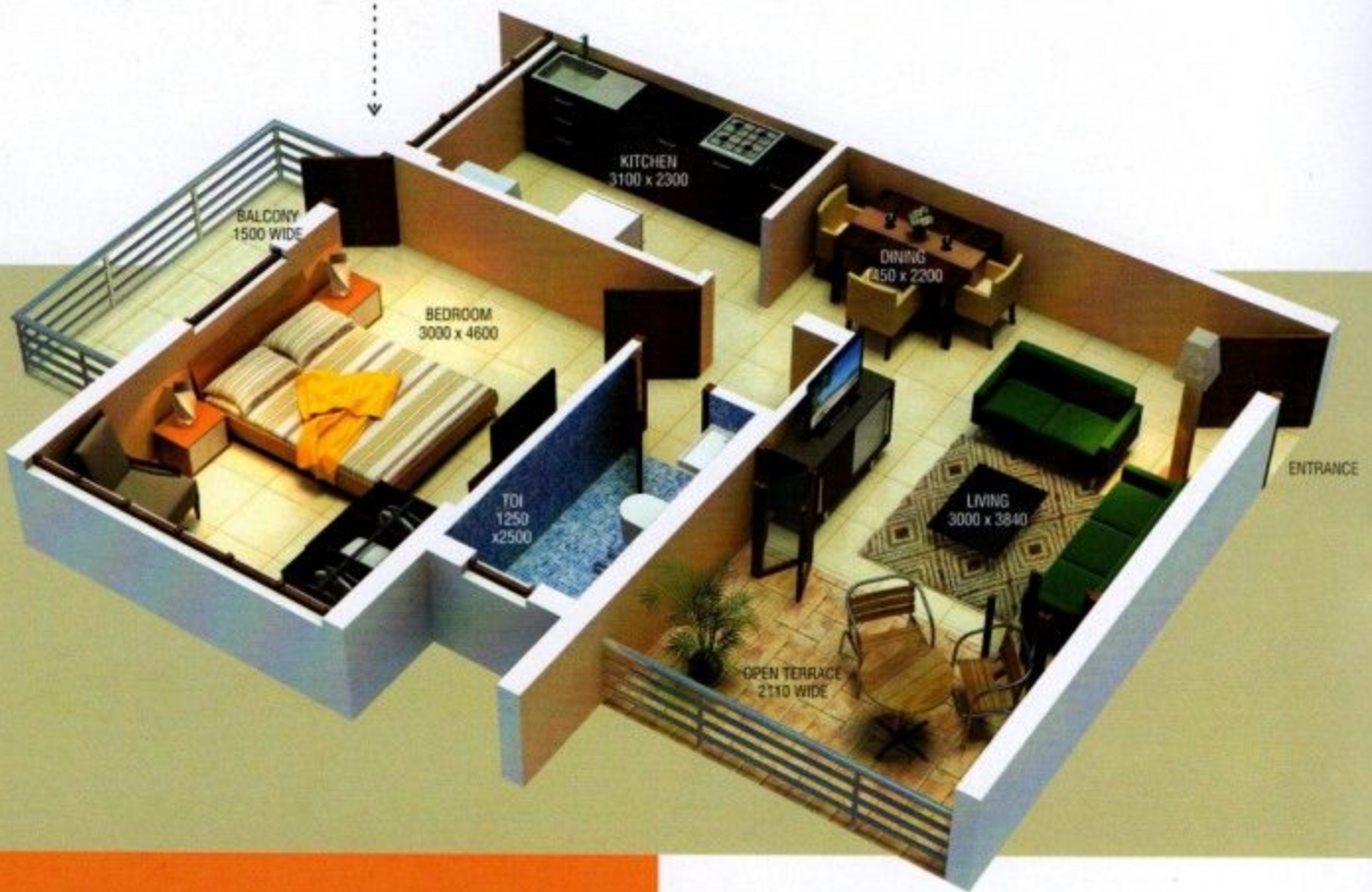
Apartment Type 1