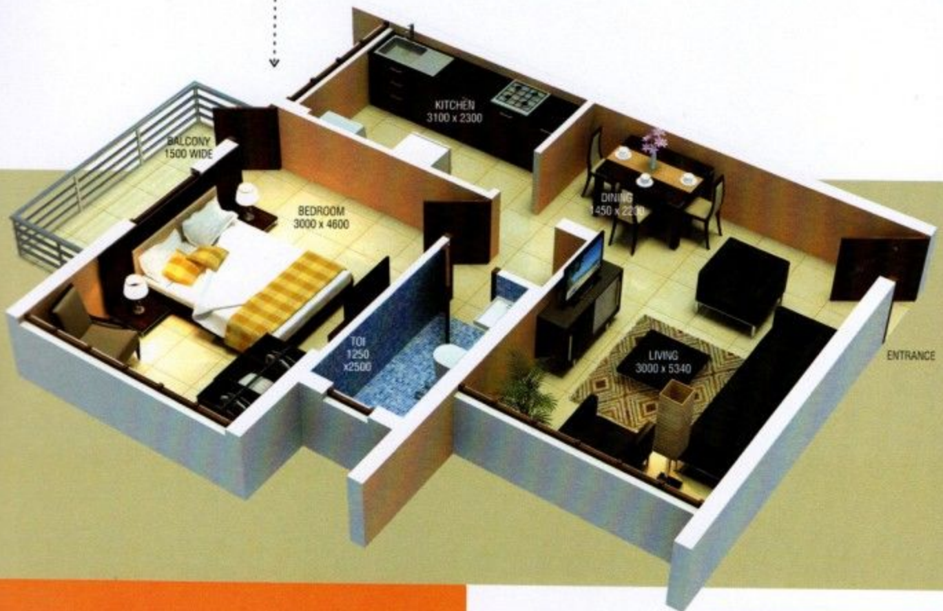
Apartment Type 2