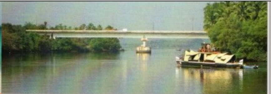
Quaint village environment