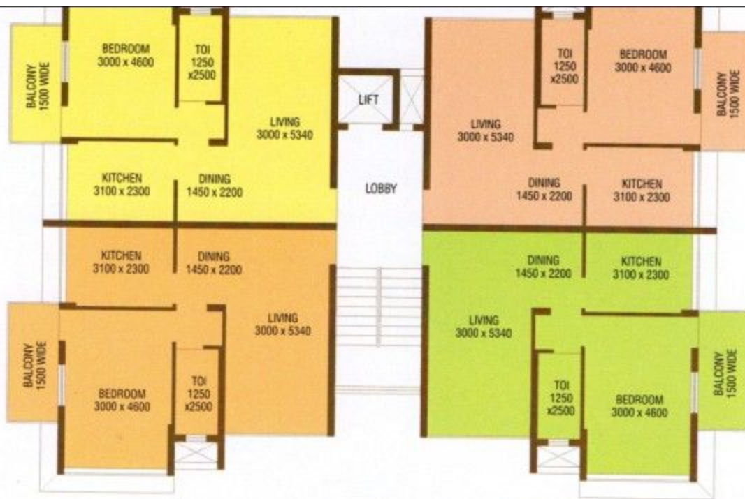
First & Third floor plan