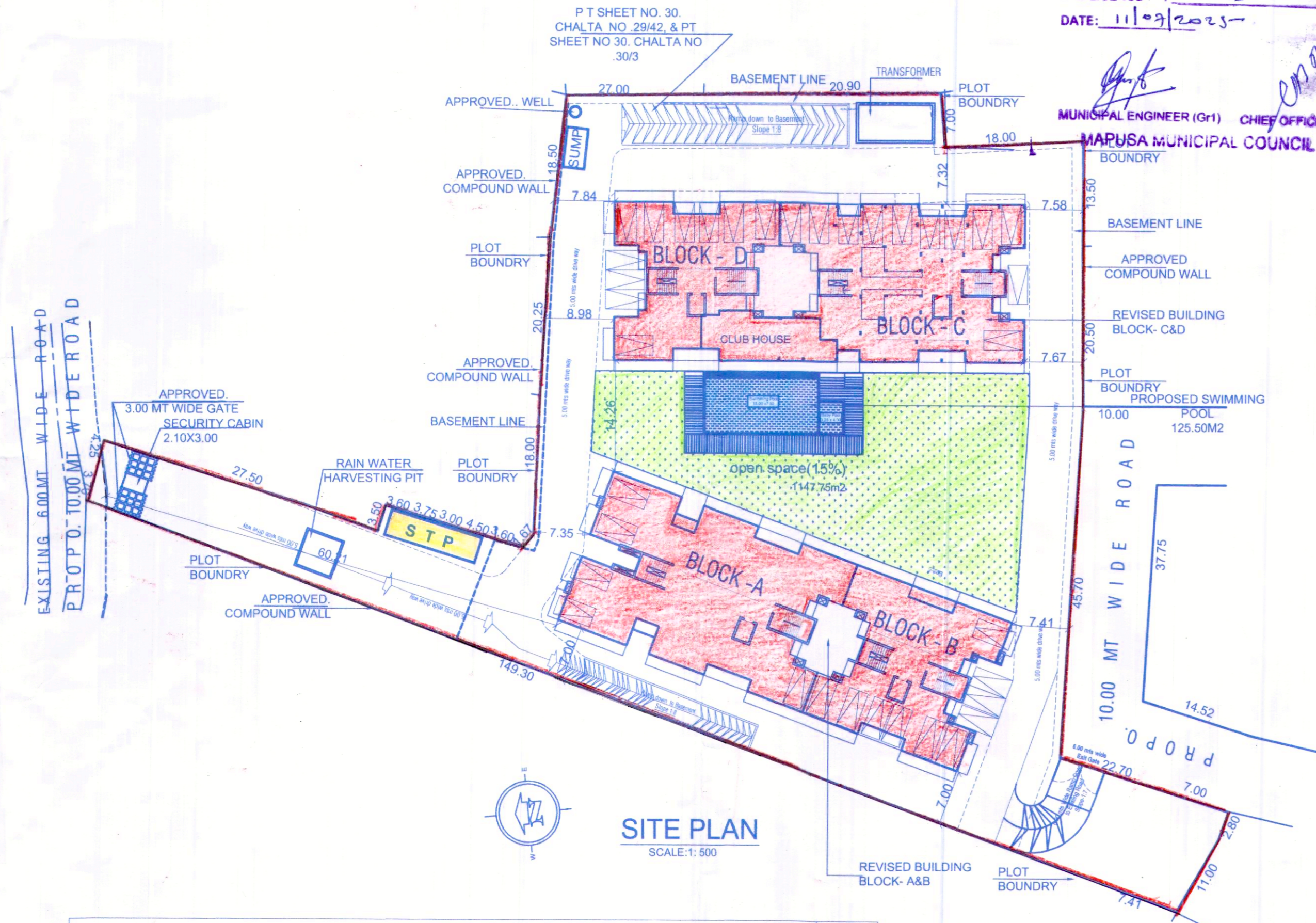
SITE PLAN SCALE: 1:500

MUNICIPAL ENGINEER (Gr1) CHIEF OFFICER MAPUSA MUNICIPAL COUNCIL