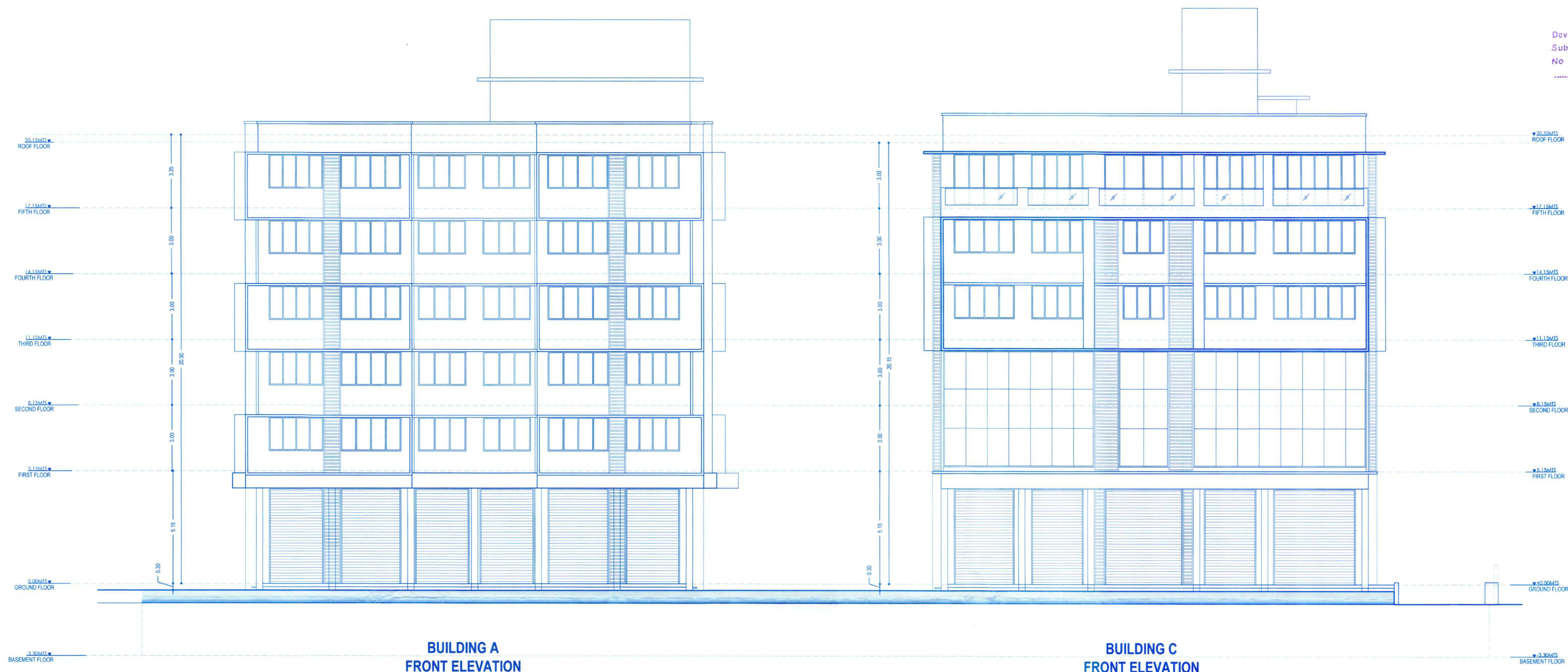
BUILDING A FRONT ELEVATION

[Signature] Municipal Engineer Margao Municipal Council