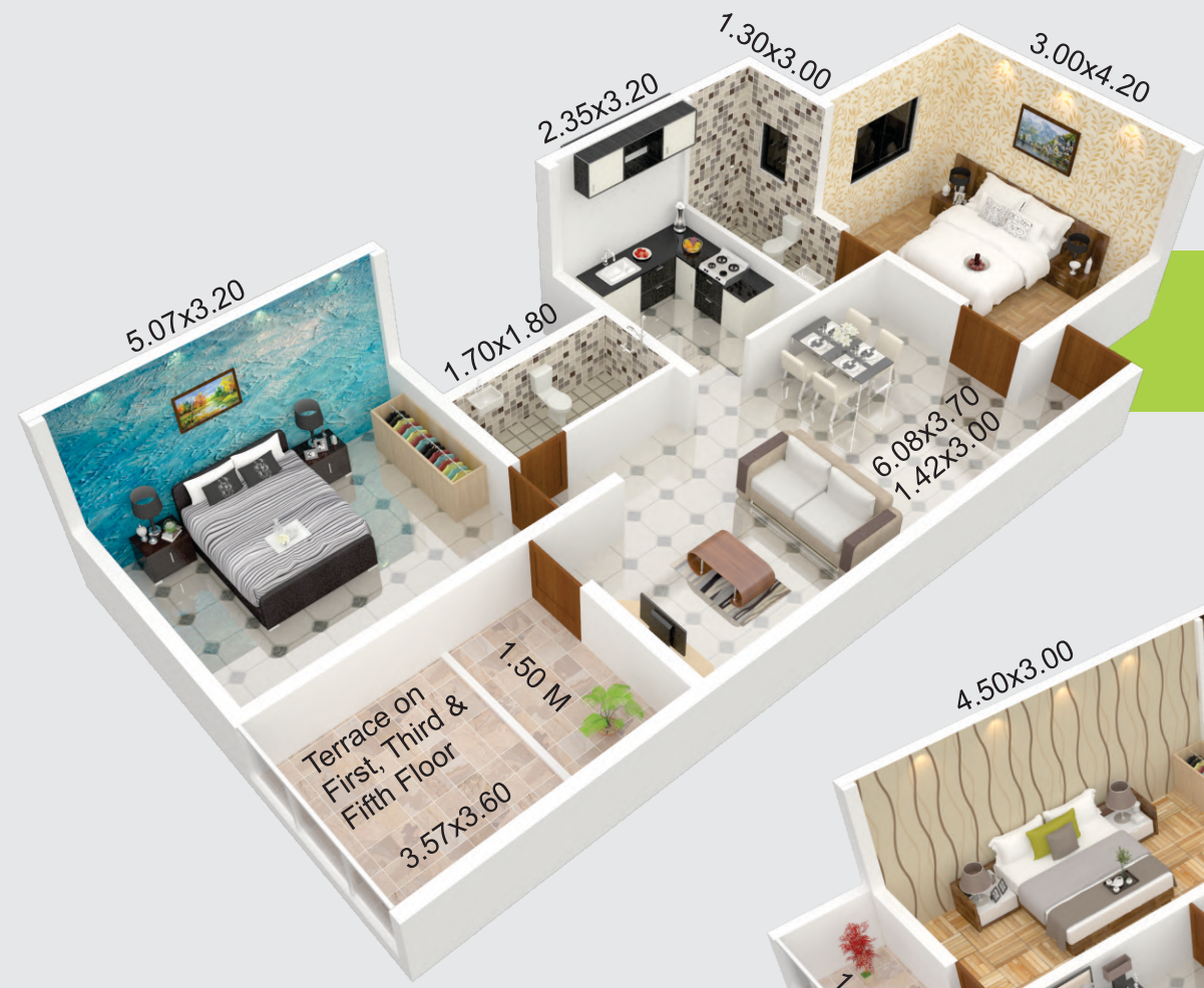
Flat Type 01