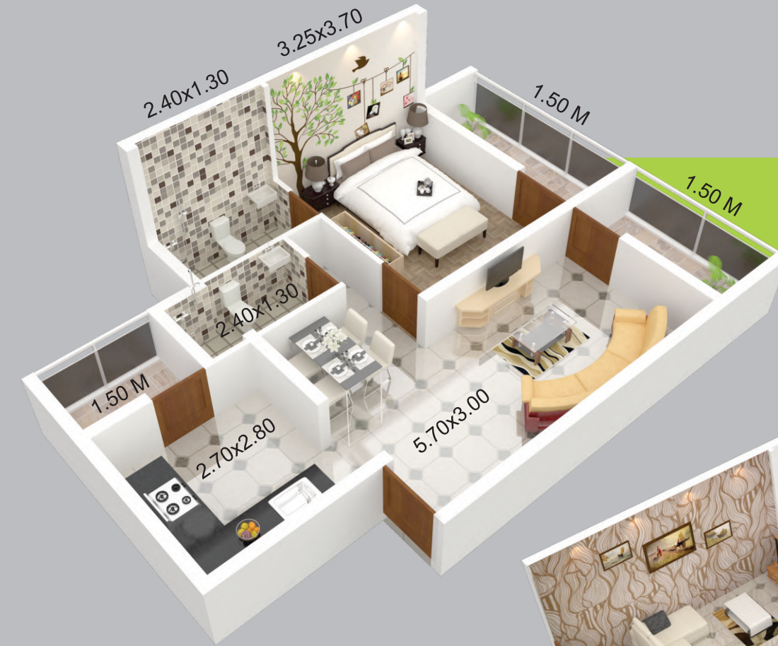
Flat Type 03