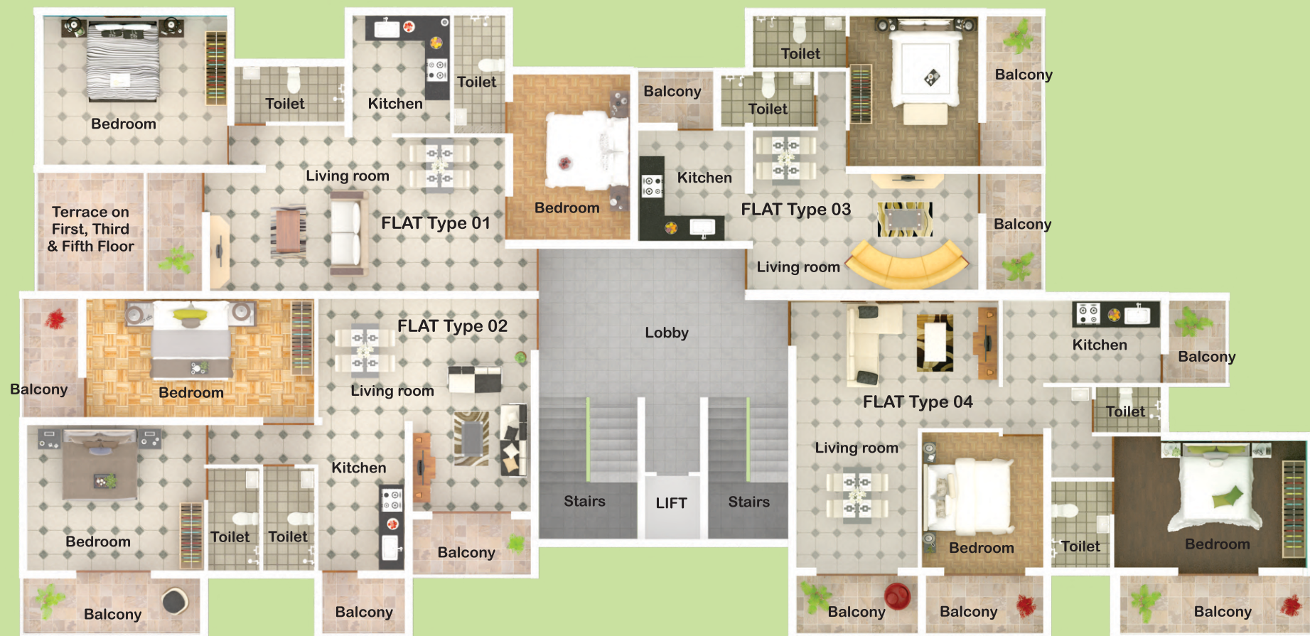
TYPICAL FIRST, SECOND, THIRD, FOURTH, FIFTH & SIXTH FLOOR