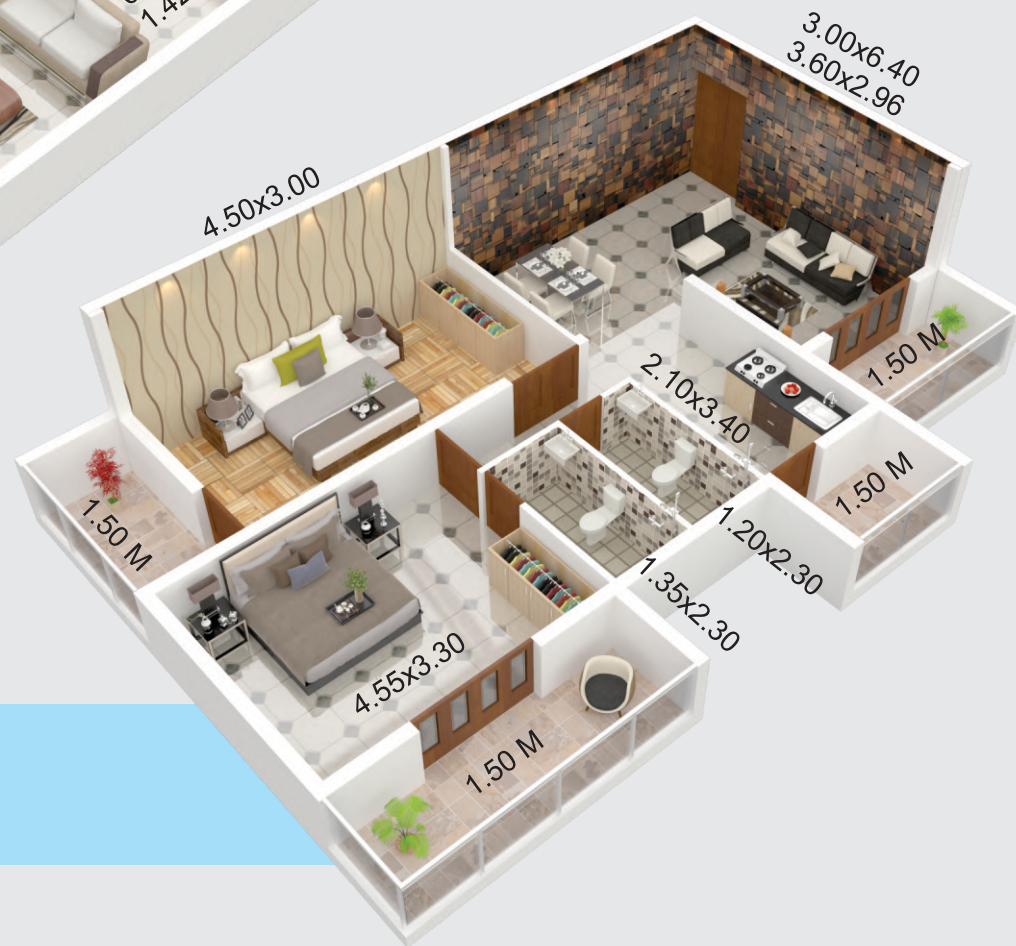
Flat Type 02