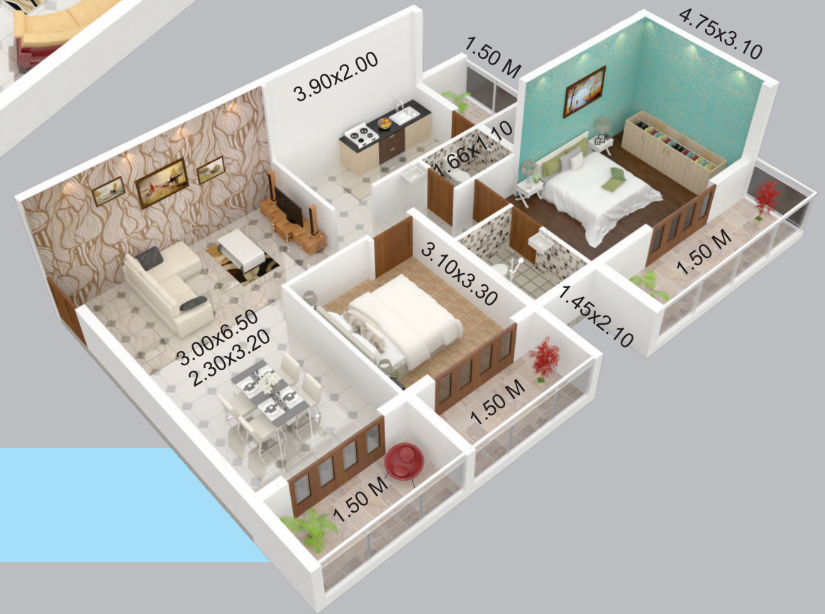
Flat Type 04