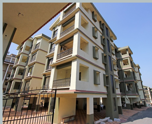
Vision Royal, Mercedes