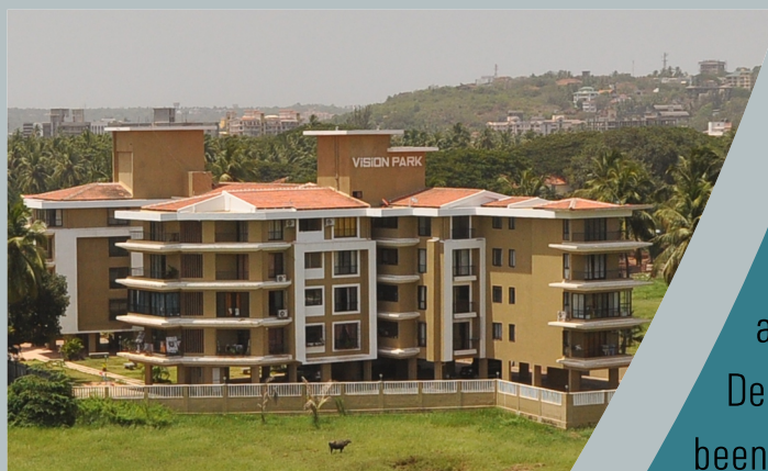
Vision Park, Tonca