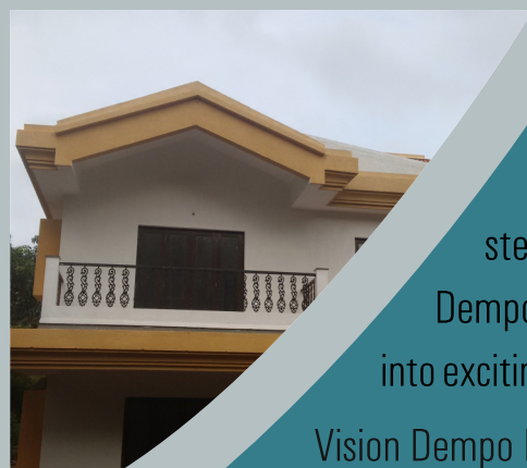
Vision Luxuria, Assagao