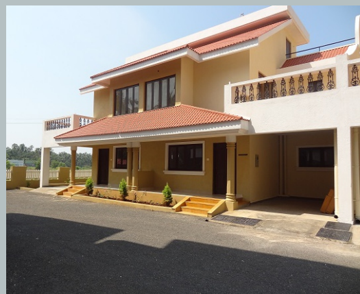
Vision Greens, Arpora