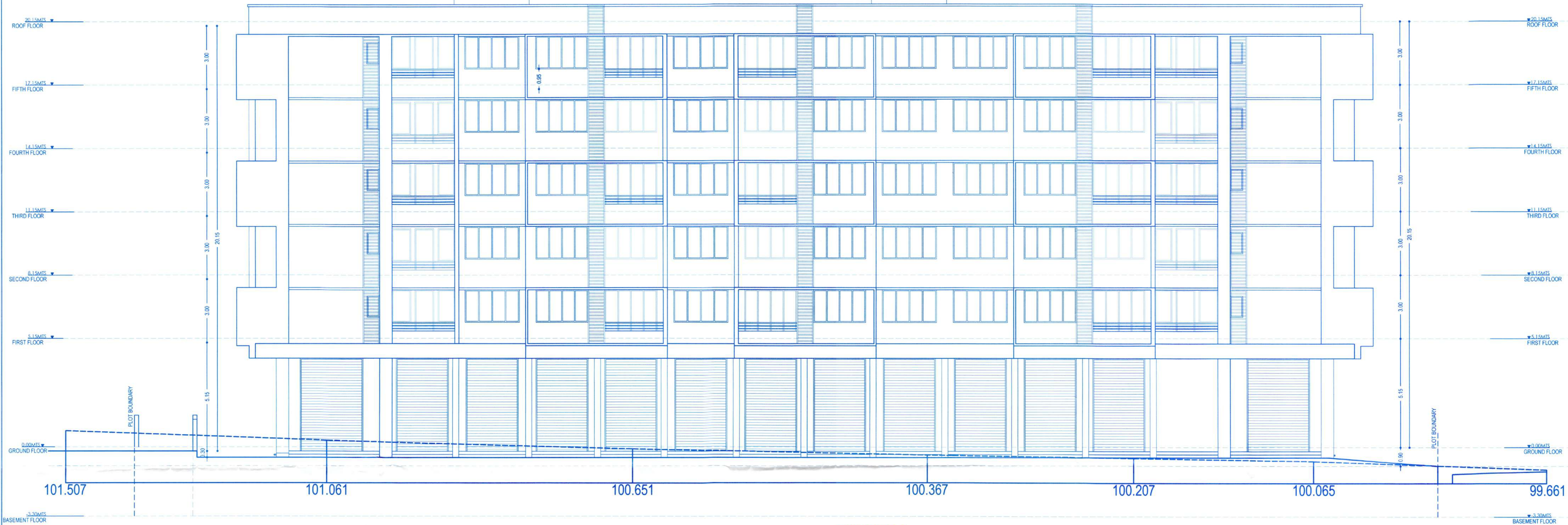
BUILDING A LEFT SIDE ELEVATION

Revised Plan License issued under No. A/17/2022-23 Dated: 18/04/2024 Subject to the conditions stipulated therein CHIEF OFFICER MARGAO MUNICIPAL COUNCIL