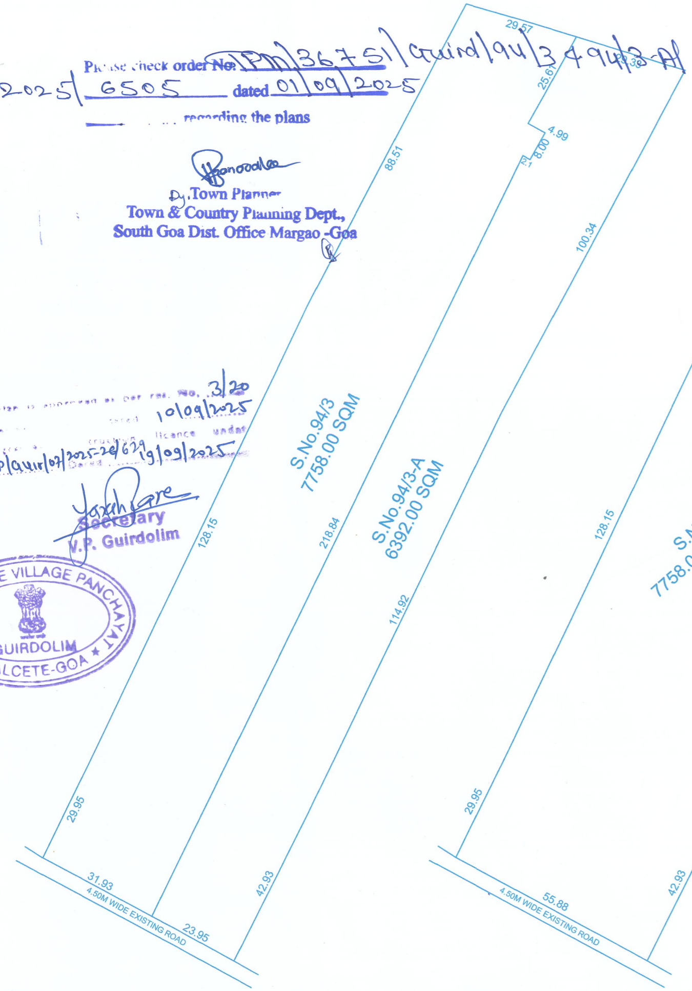
SITE PLAN AFTER AMALGAMATION SCALE 1:1000