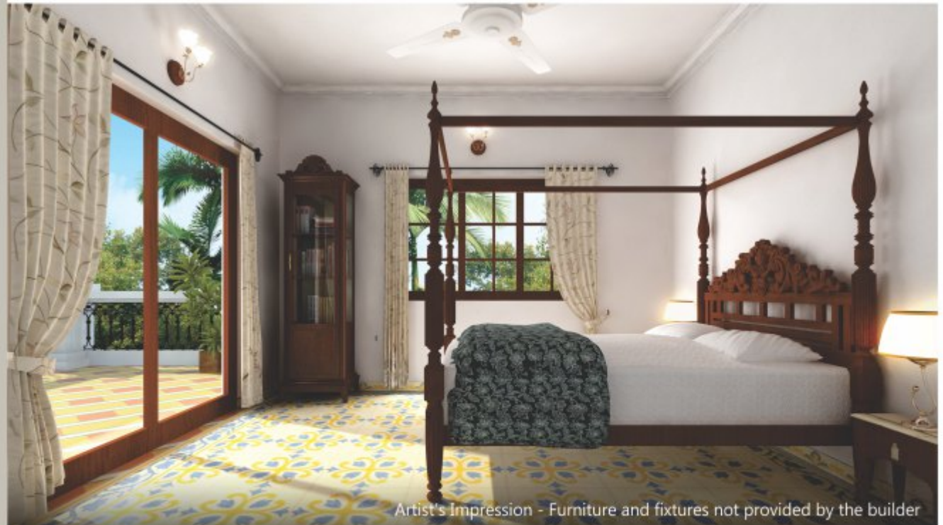
Artist's Impression - Furniture and fixtures not provided by the builder