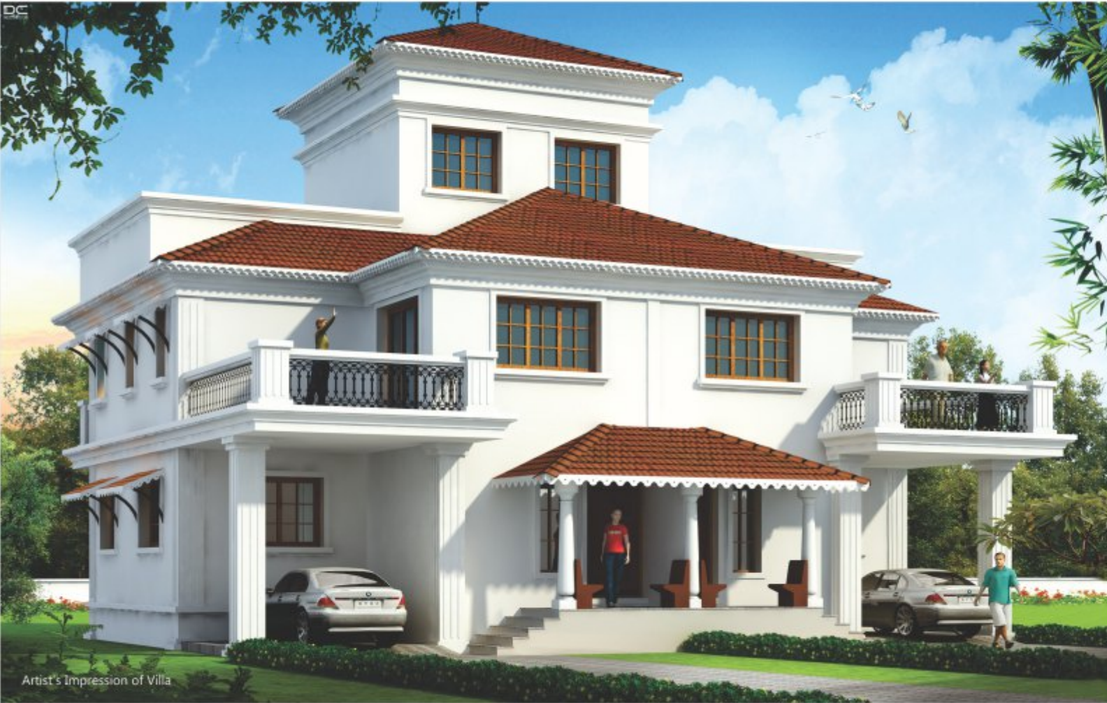
Artist's Impression of Villa