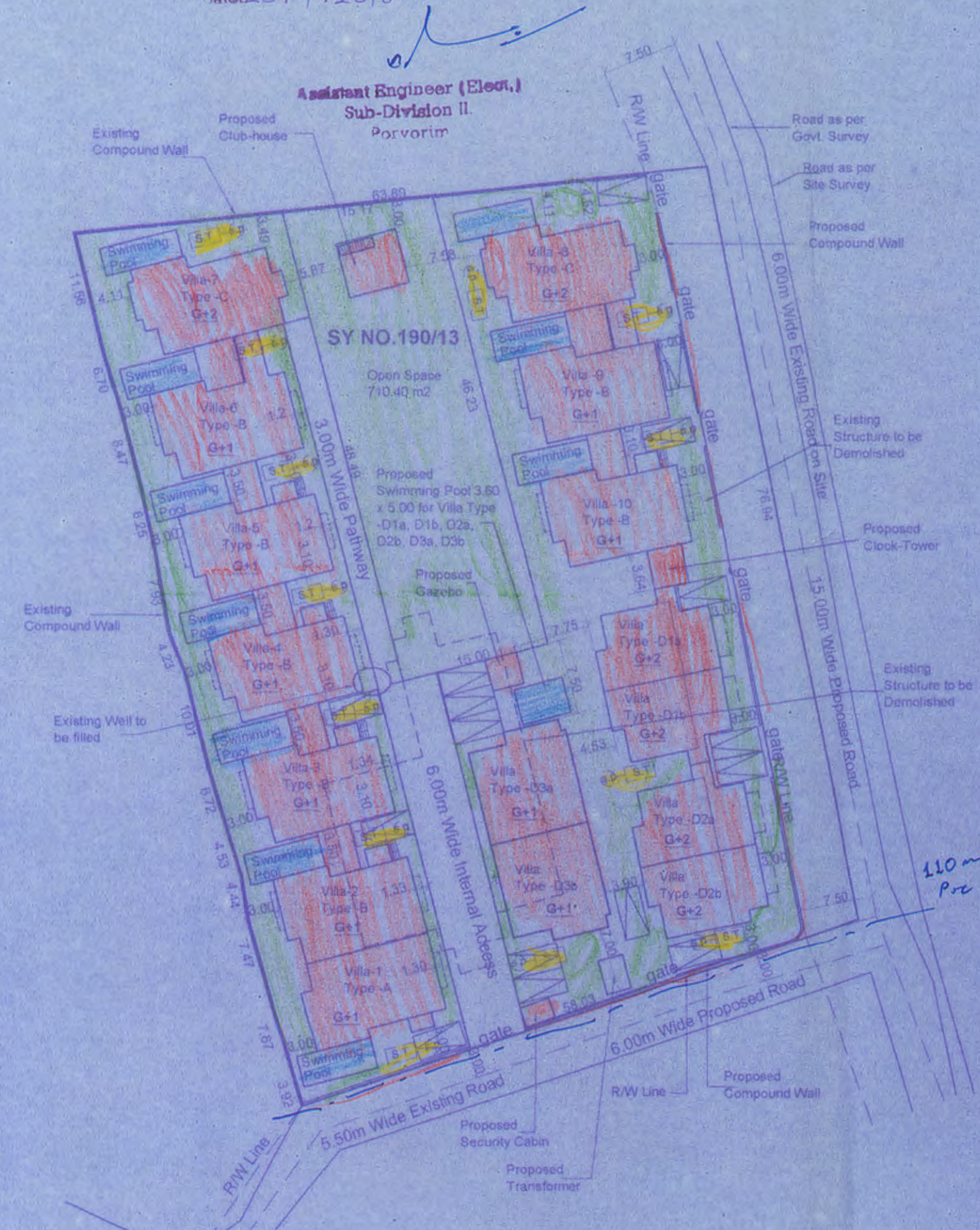
SITE PLAN (Scale : -1:500)