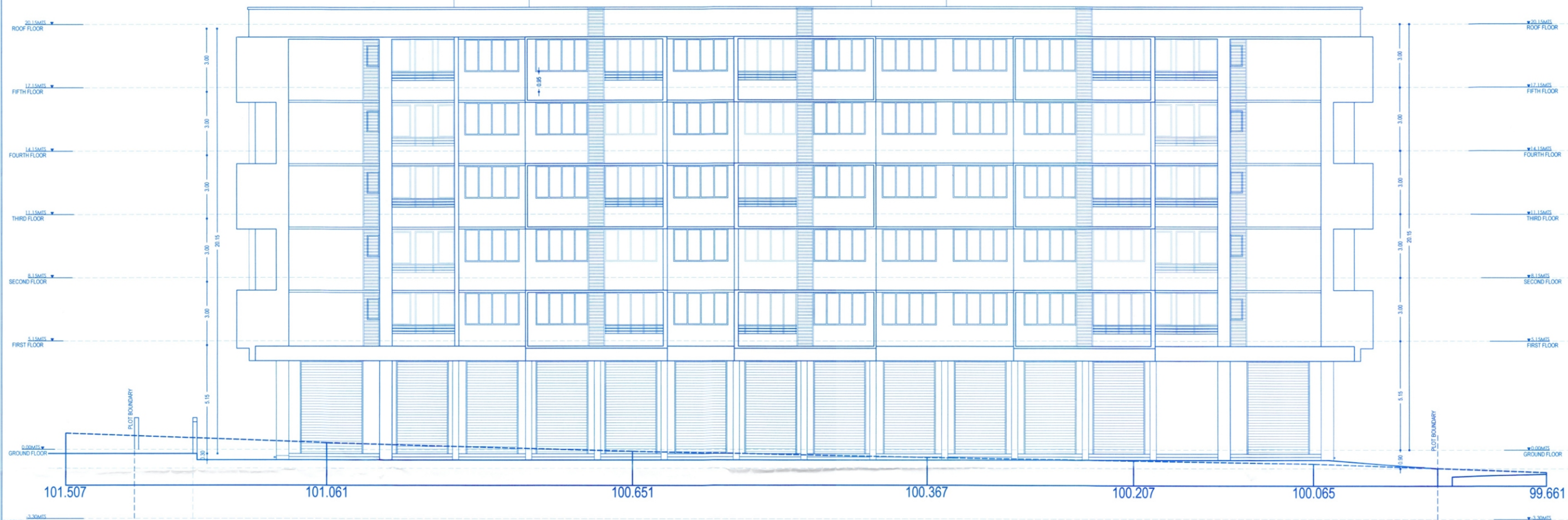
BUILDING A LEFT SIDE ELEVATION

Revised Plan License issued under No. A/17/2022-23 Subject to the conditions stipulated therein CHIEF OFFICER MARGAO MUNICIPAL COUNCIL