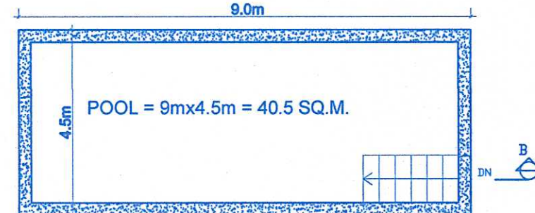
PLAN OF POOL Scale:- 1:100