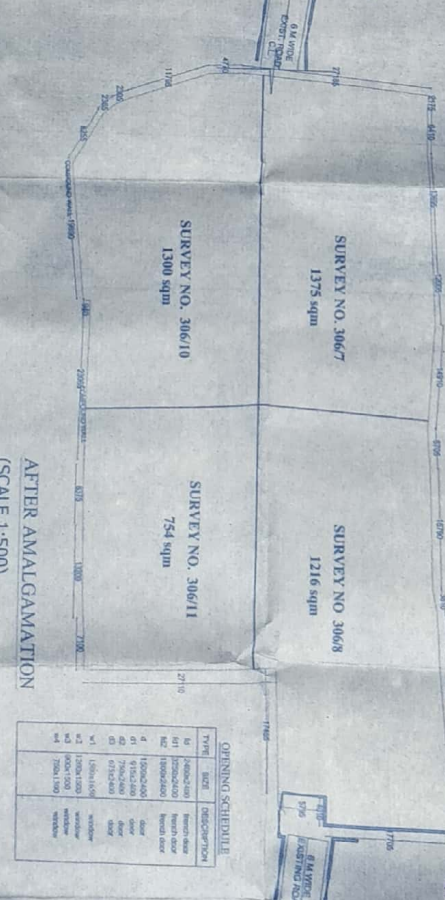
AFTER AMALGAMATION (SCALE 1:500)